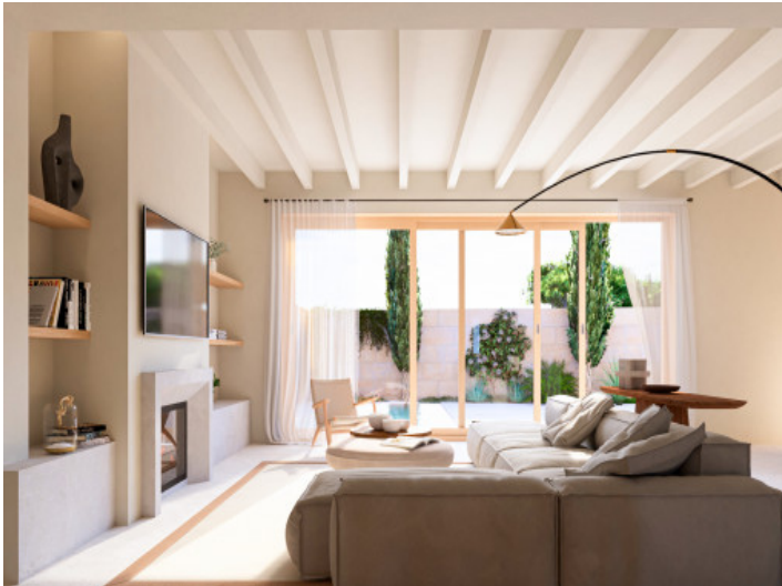
Beautiful living area