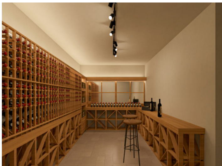
Spacious wine cellar