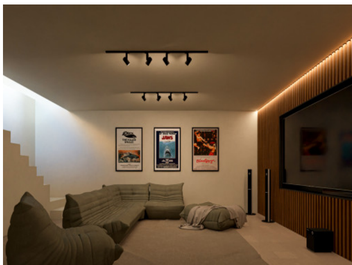
Fantastic home cinema