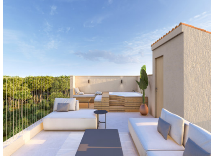
Large roof terrace