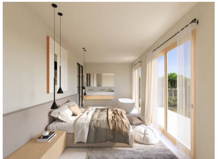
Light-flooded double bedroom

All information is correct to the best of our knowledge. Errors and prior sale excepted. This prospectus is purely for information purposes. Only the notarized deed of sale is legally binding.