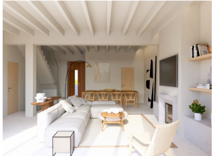
Open plan living and dining area