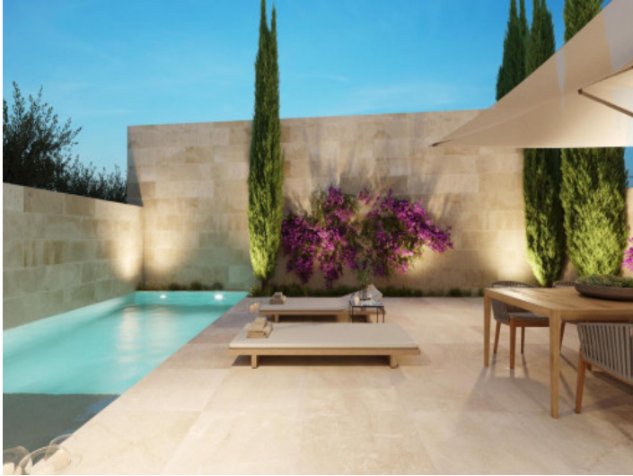
Fantastic pool area