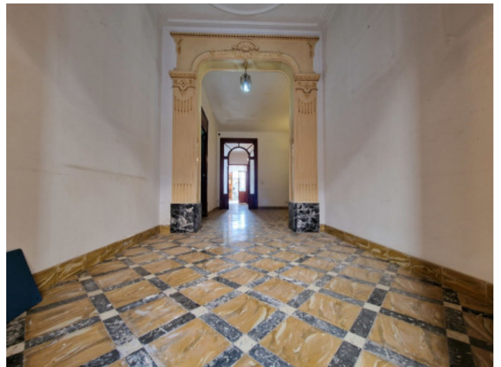
Entrance area with original tiles