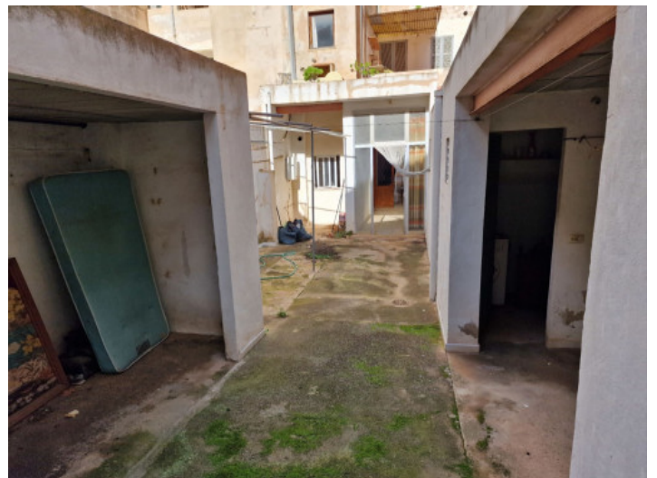
Patio view to the façade

All information is correct to the best of our knowledge. Errors and prior sale excepted. This prospectus is purely for information purposes. Only the notarized deed of sale is legally binding.