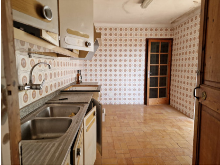
Kitchen with vintage tiles