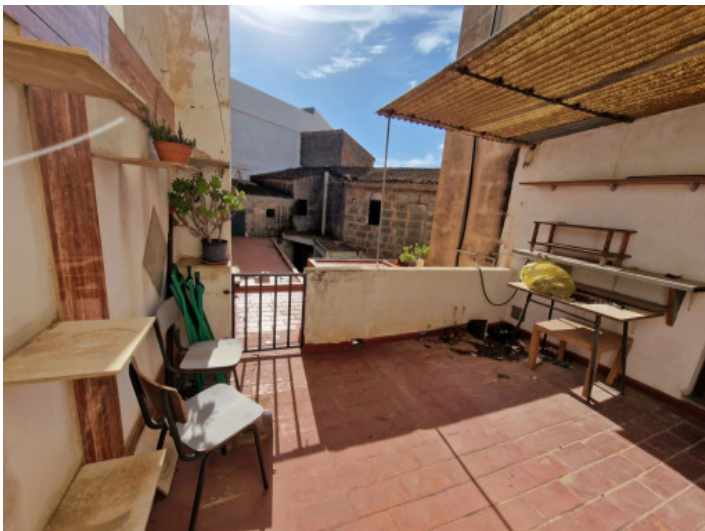
Sunny terrace on the first floor