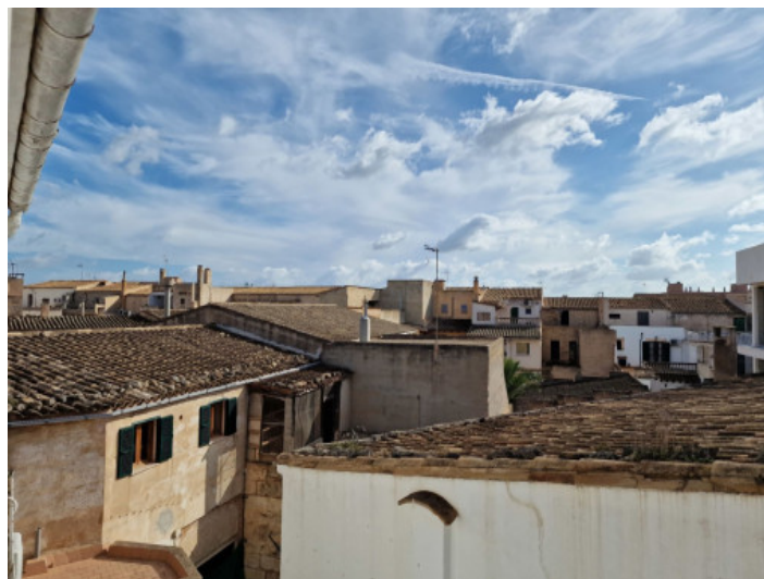
Views over the village

All information is correct to the best of our knowledge. Errors and prior sale excepted. This prospectus is purely for information purposes. Only the notarized deed of sale is legally binding.