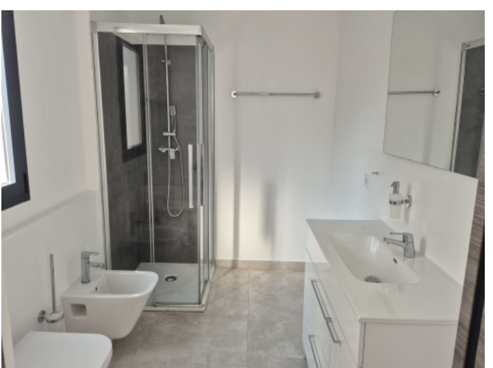
Bright bathroom Additonal bathroom Additonal bathroom.

PORTA MALLORQUINA • THERESIENSTR.: 81, 80333 MUNICH TEL. +34 971 698 242 • INFO@PORTAMALLORQUINA.COM