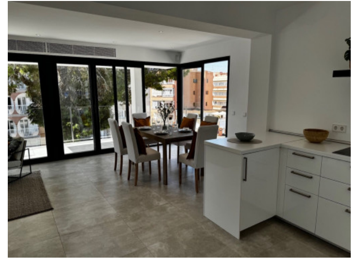
Modern kitchen and dining area

PORTA MALLORQUINA® Your home. Our passion.