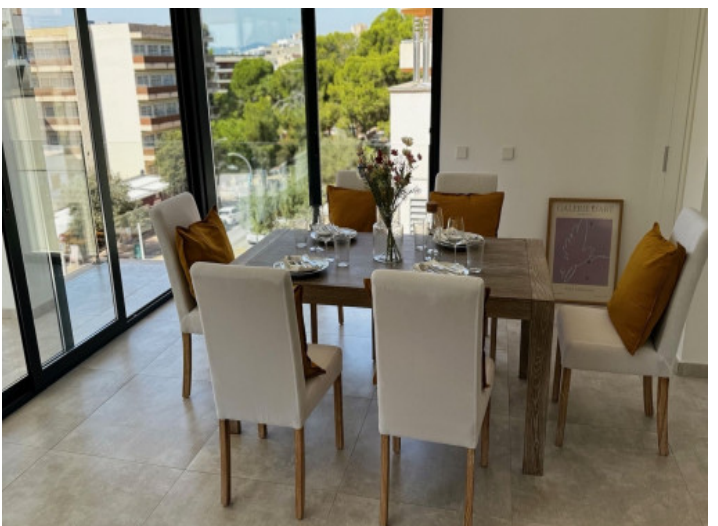
Lovely dining area Adjoining the kitchen Dining area adjoining the kitchen All information is correct to the best of our knowledge. Errors and prior sale excepted. This prospectus is purely for information purposes. Only the notarized deed of sale is legally binding.