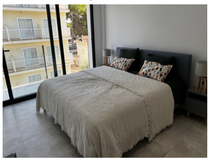
Spacious double bedroom