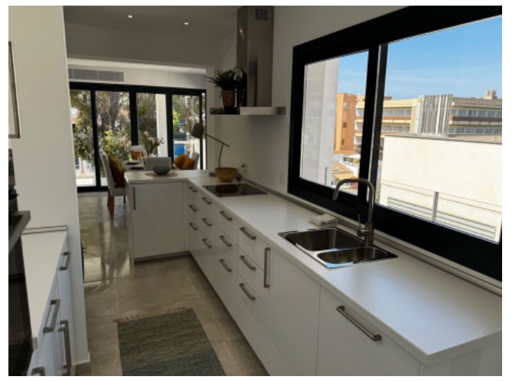
Fully fitted kitchen