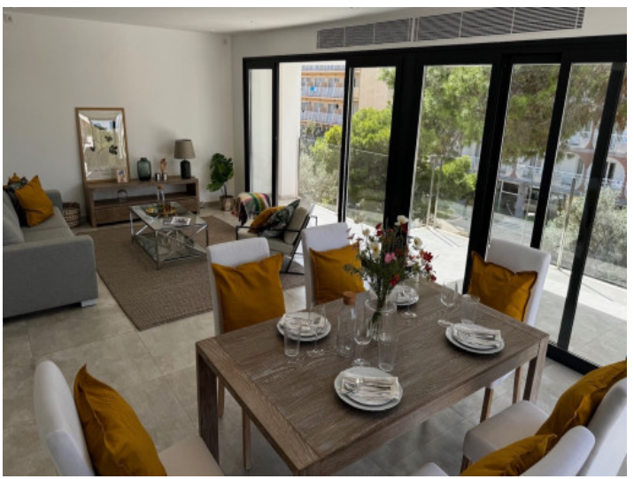
Light-flooded living and dining area