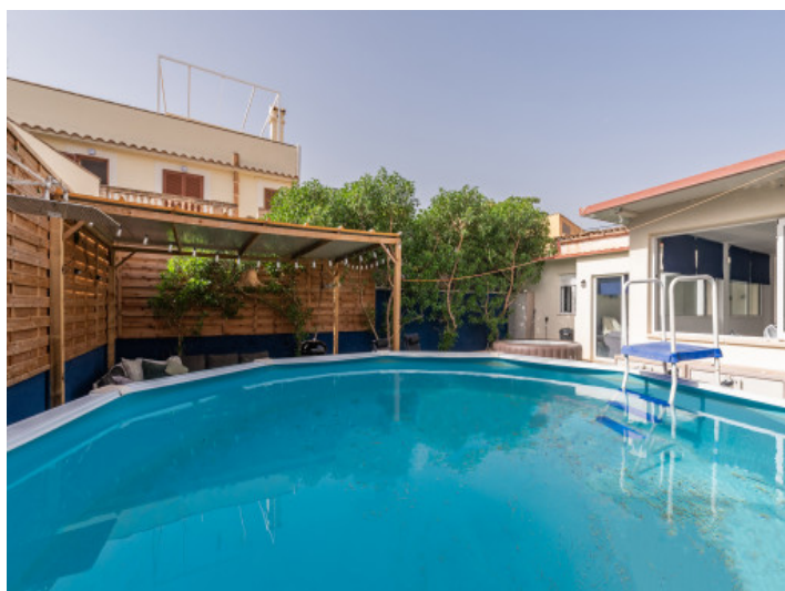
Beautiful renovated house with unobstructed views in the coastal village of S'Estanyol

All information is correct to the best of our knowledge. Errors and prior sale excepted. This prospectus is purely for information purposes. Only the notarized deed of sale is legally binding.