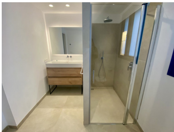
Townhouse with 2 bathrooms

All information is correct to the best of our knowledge. Errors and prior sale excepted. This prospectus is purely for information purposes. Only the notarized deed of sale is legally binding.