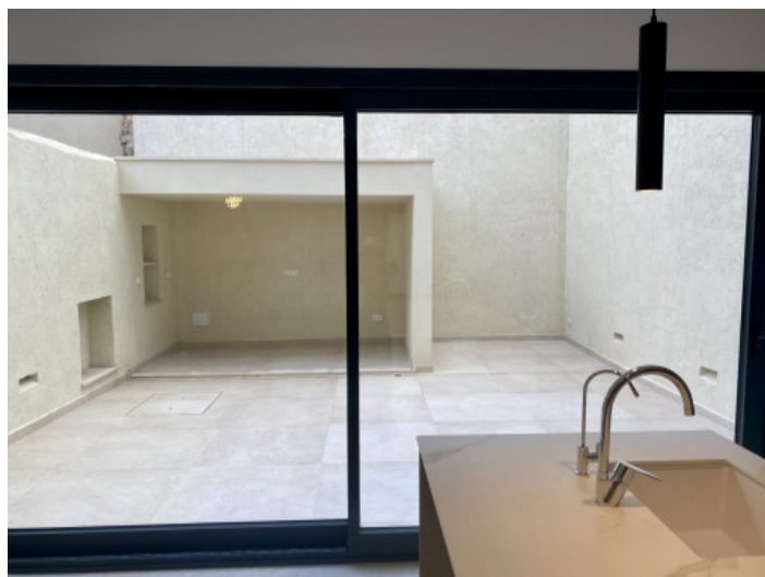
View to the patio

All information is correct to the best of our knowledge. Errors and prior sale excepted. This prospectus is purely for information purposes. Only the notarized deed of sale is legally binding.