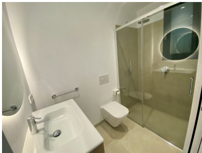
Bathroom with shower