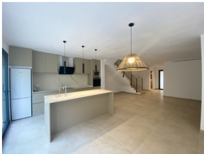
Open kitchen and living area