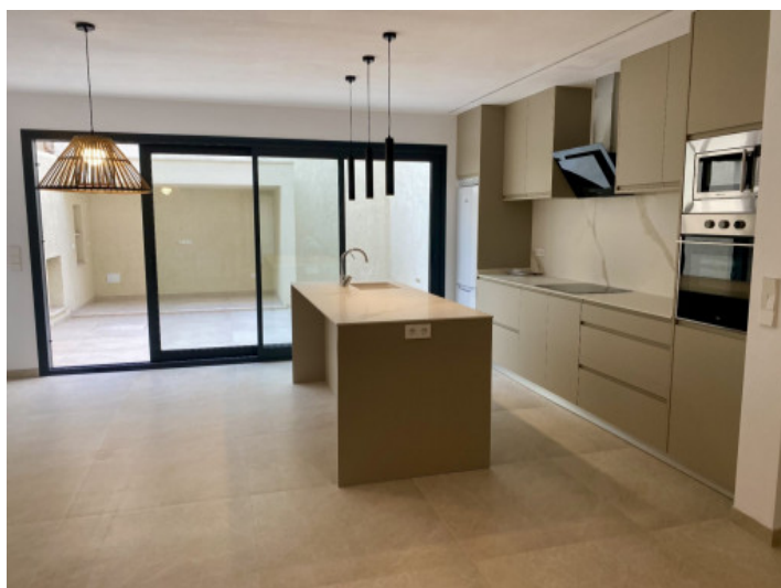
Modern kitchen and patio