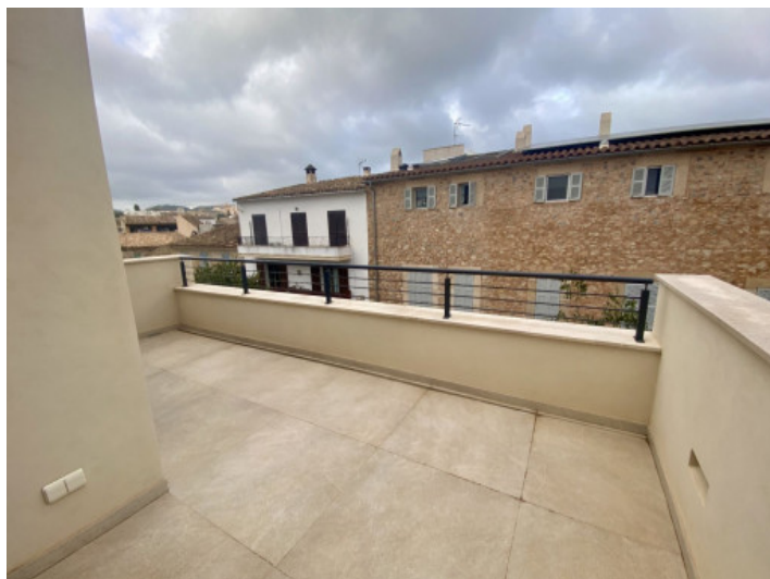
Balcony and view to the neighbourhood