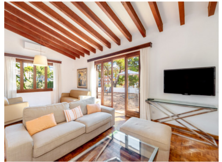
Living area with access to a terrace