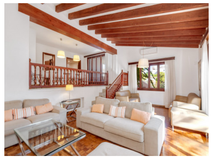
Light-flooded living area