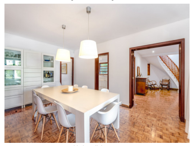
Modern dining area