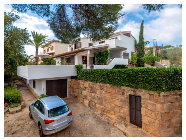
Garage of the property