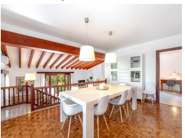
Open plan dining area