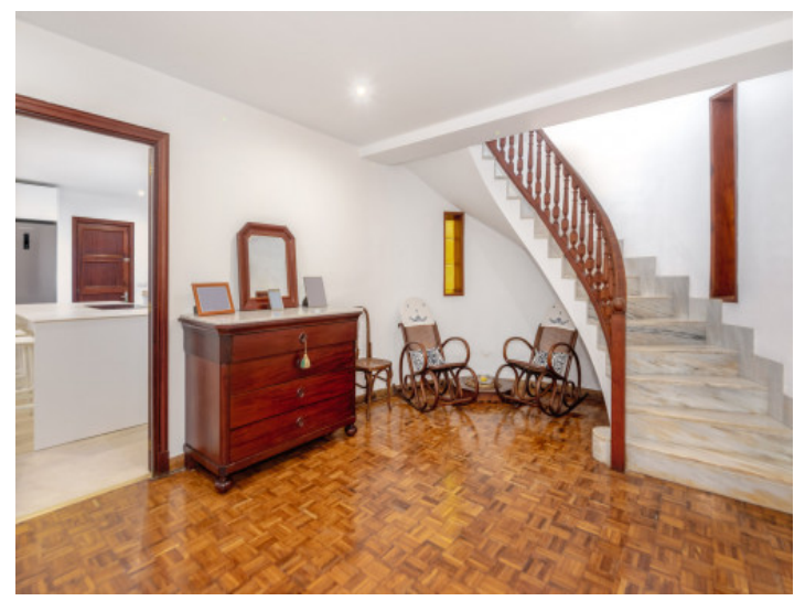
Elegant entrance area