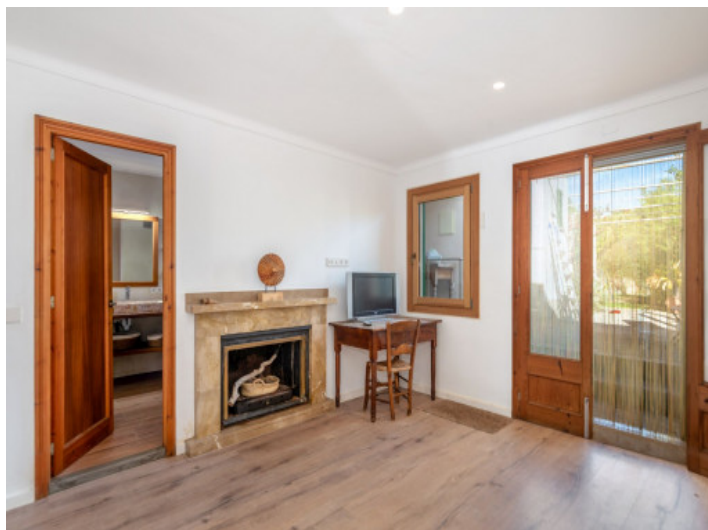
Bathroom on the groundfloor