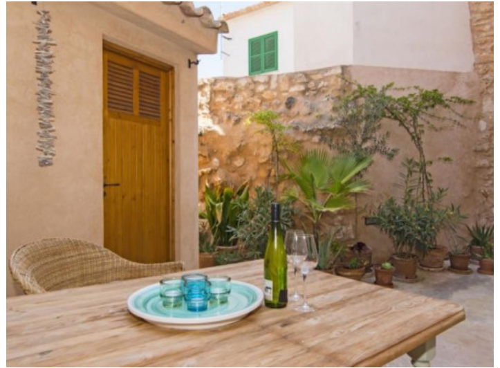
Central location in Santanyi