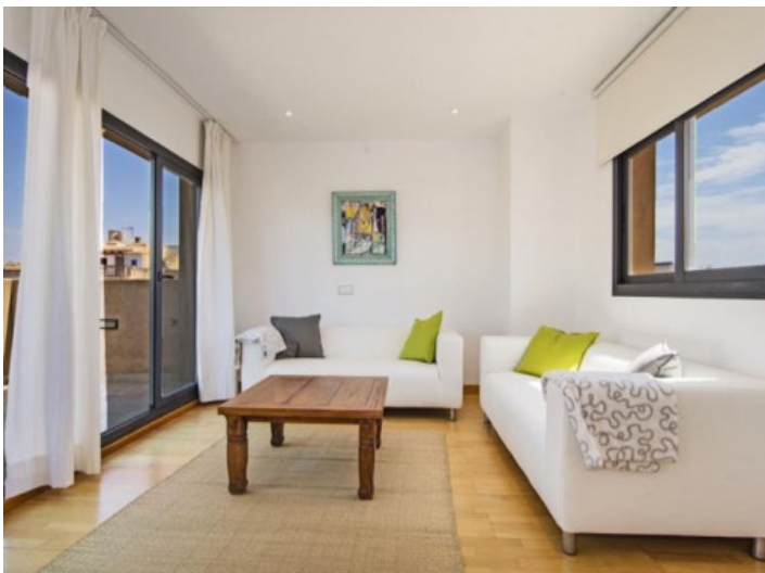
Beautiful living area