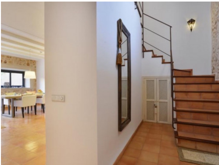
Entrance area and staircase