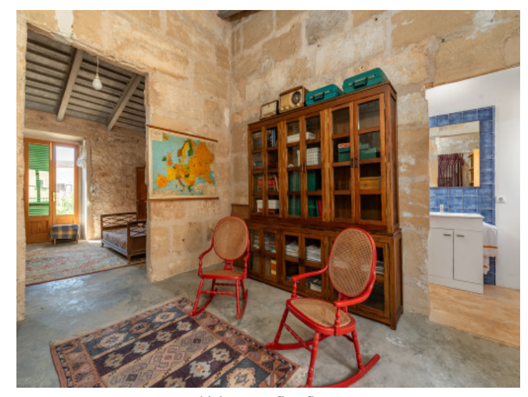
Living area first floor