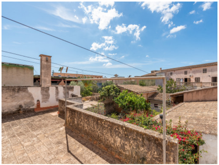
Terrace with views