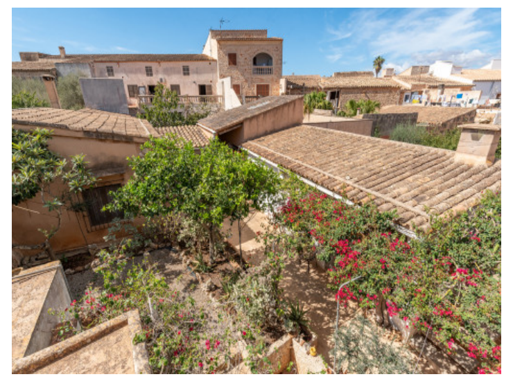
Viwew to the patio