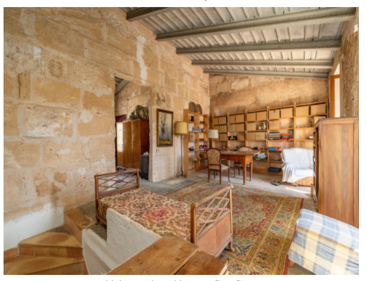
Living and working ara first floor