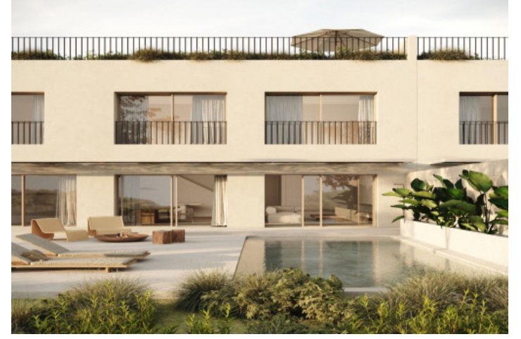
Beautiful townhouse with garden and pool