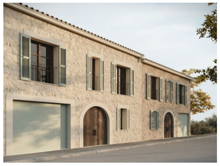
Exclusive new-build townhouse with pool and roof terrace in Ses Salines

PORTA MALLORQUINA® Your home. Our passion.