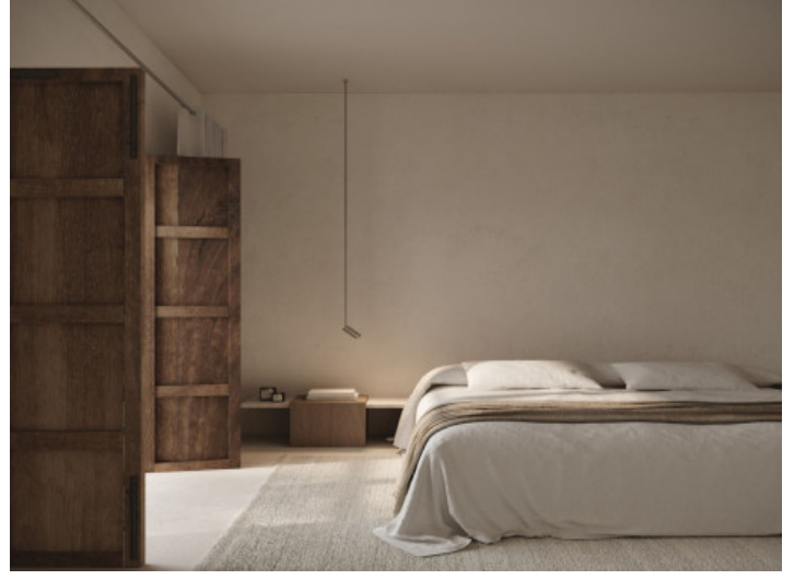
Townhouse with 3 bedrooms

PORTA MALLORQUINA® Your home. Our passion.