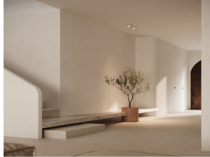
Sitting area close to the jacuzzi on the rooftop Entrance area All information is correct to the best of our knowledge. Errors and prior sale excepted. This prospectus is purely for information purposes. Only the notarized deed of sale is legally binding.

PORTA MALLORQUINA • THERESIENSTR.: 81, 80333 MUNICH TEL. +34 971 698 242 • INFO@PORTAMALLORQUINA.COM