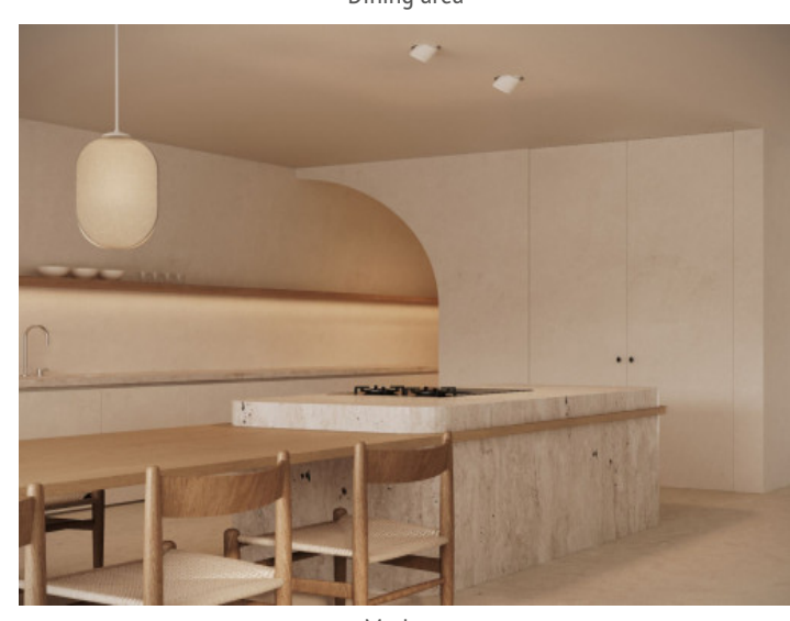
Cooking island Modern All information is correct to the best of our knowledge. Errors and prior sale excepted. This prospectus is purely for information purposes. Only the notarized deed of sale is legally binding.

PORTA MALLORQUINA • THERESIENSTR.: 81, 80333 MUNICH TEL. +34 971 698 242 • INFO@PORTAMALLORQUINA.COM