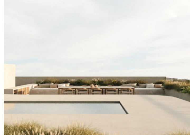
Pool area in the patio