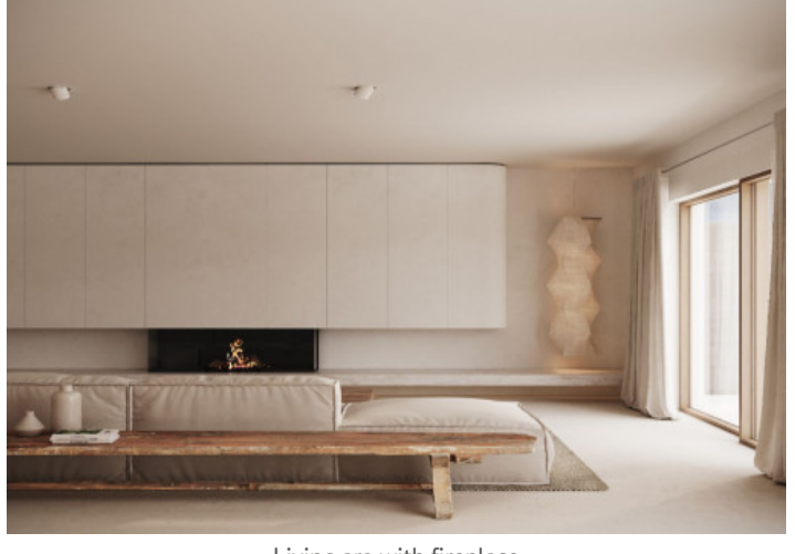
Living ara with fireplace