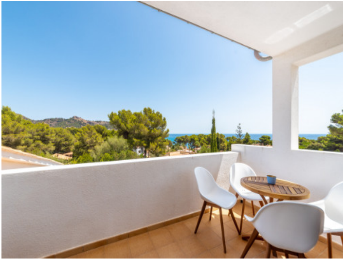
Modern Mediterranean house, ideal for a winter rental, in Costa Canyamel, 15 minutes from Mallorca's capital.