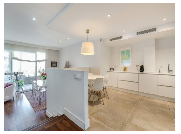
Access to the elegant kitchen

All information is correct to the best of our knowledge. Errors and prior sale excepted. This prospectus is purely for information purposes. Only the notarized deed of sale is legally binding.