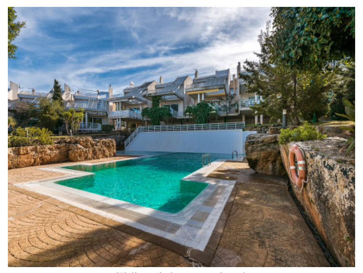
Well-tended communal pool