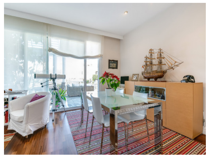
Dining area with terrace access