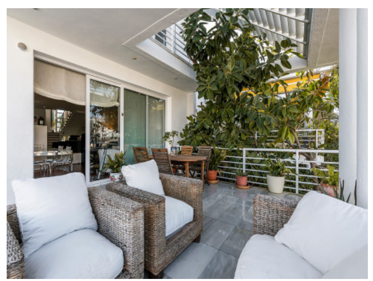
Beautiful terrace with lounge area