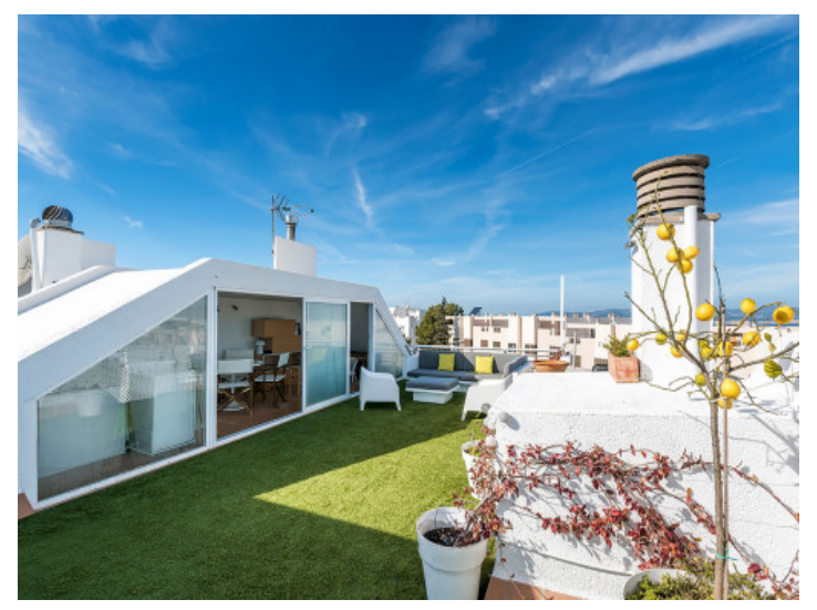
Fantastic roof terrace