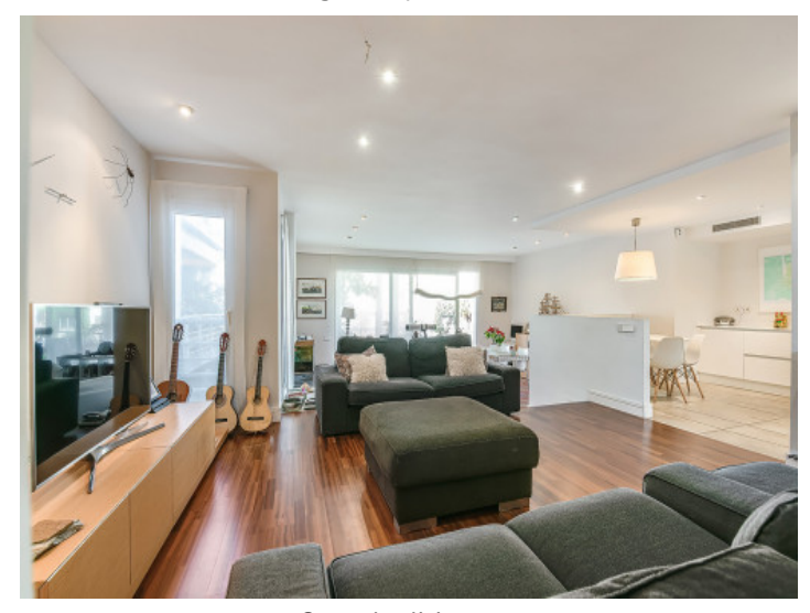
Open plan living area