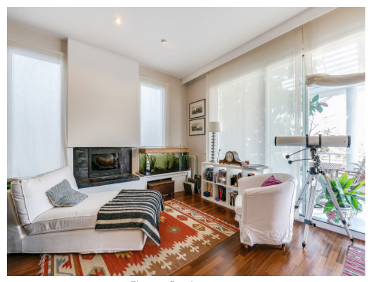
Elegant fireplace corner