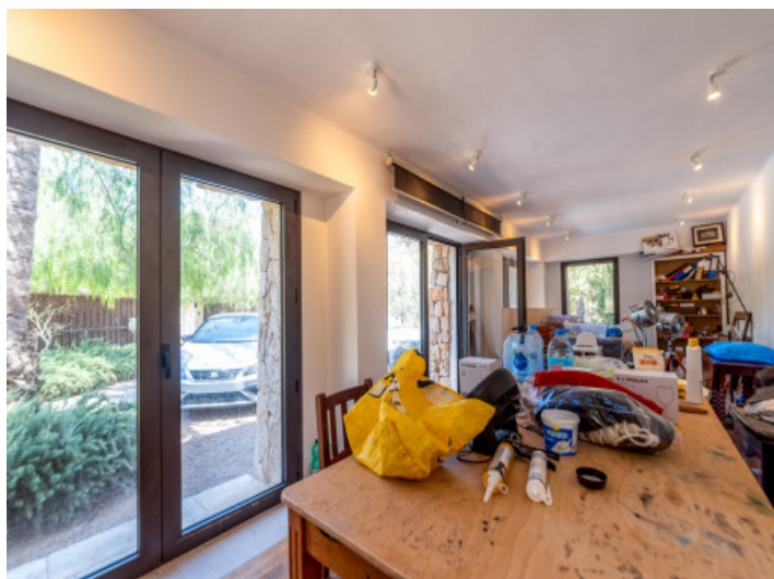
Room in the annex

All information is correct to the best of our knowledge. Errors and prior sale excepted. This prospectus is purely for information purposes. Only the notarized deed of sale is legally binding.