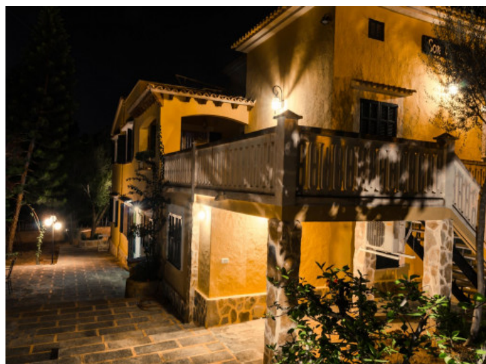
The property by night