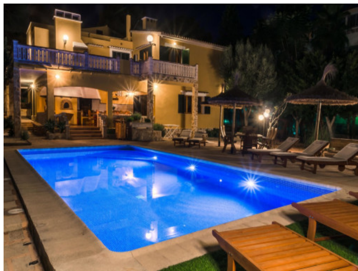
Beautiful property at night