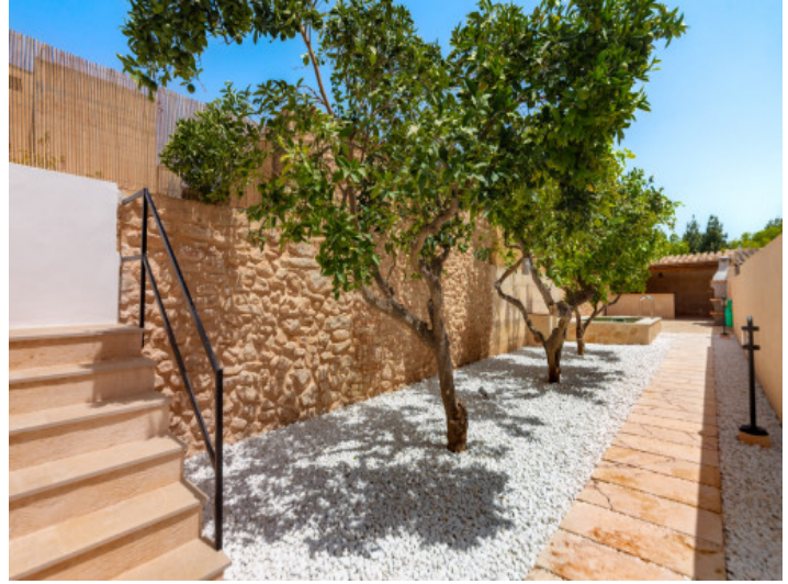
BBQ area Lovely patio All information is correct to the best of our knowledge. Errors and prior sale excepted. This prospectus is purely for information purposes. Only the notarized deed of sale is legally binding.

PORTA MALLORQUINA • THERESIENSTR.: 81, 80333 MUNICH TEL. +34 971 698 242 • INFO@PORTAMALLORQUINA.COM