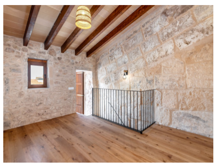
Natural stone walls