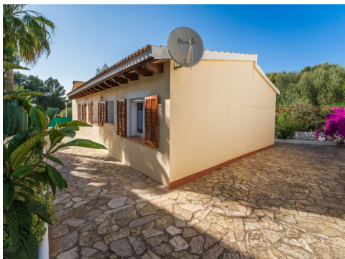
Pool construction possible