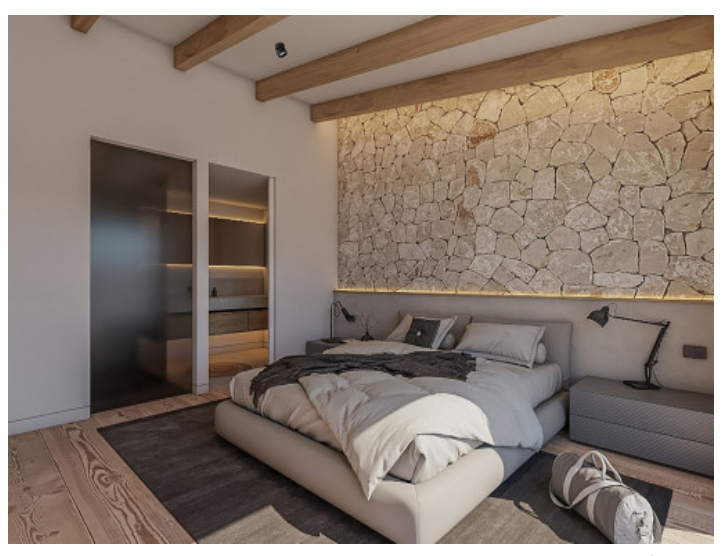
Elegantly renovated village house with pool and garden in Alaró