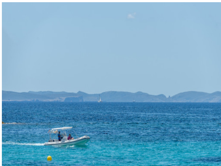
Views to Cabrera from the beach