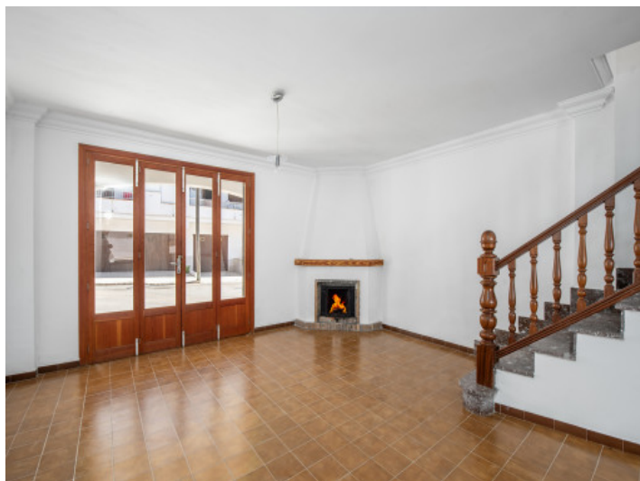
Entrance area with fireplace