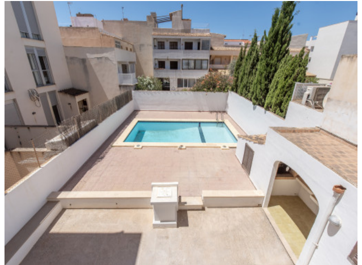
Views to the patio and pool