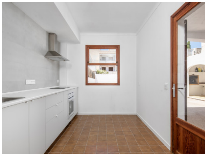
Kitchen with direct access to patio