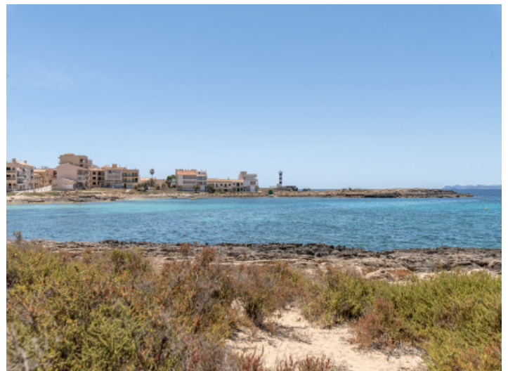
Colonia St. Jordi

All information is correct to the best of our knowledge. Errors and prior sale excepted. This prospectus is purely for information purposes. Only the notarized deed of sale is legally binding.