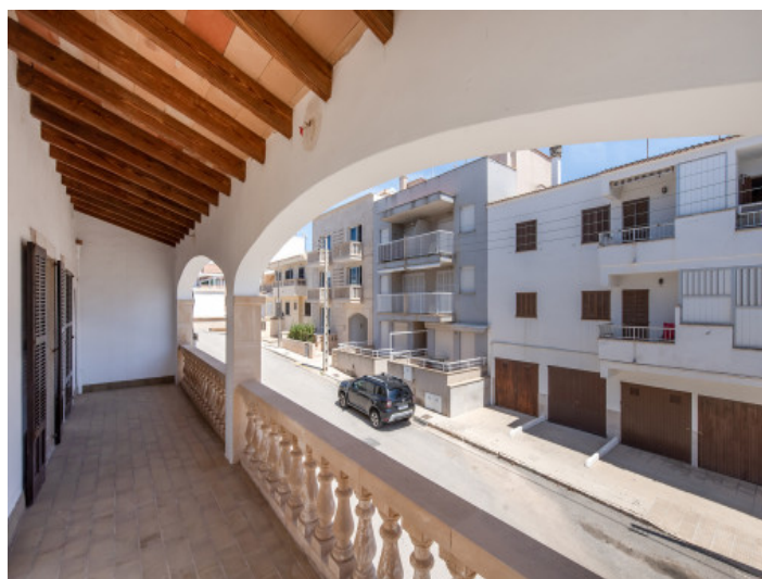
Views over the neighborhood