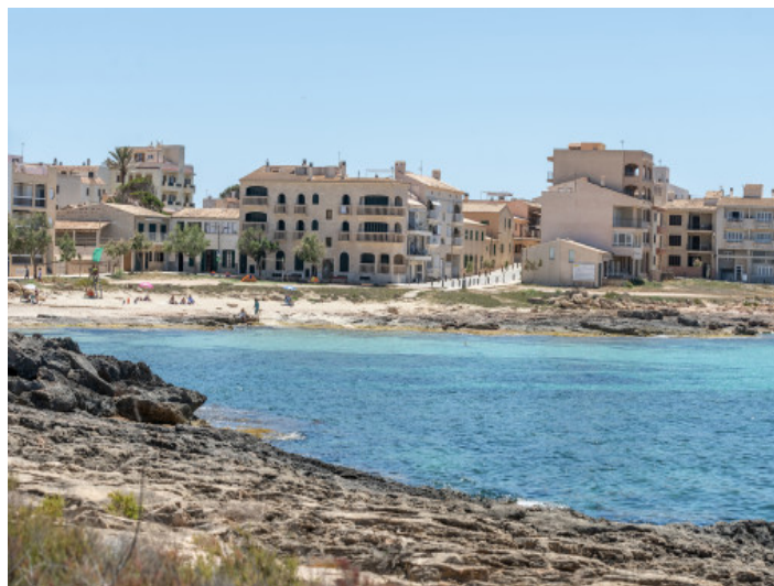
Close to Cala Gaviota beach