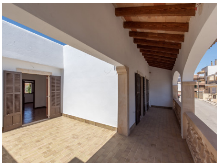
Large terrace on the first floor