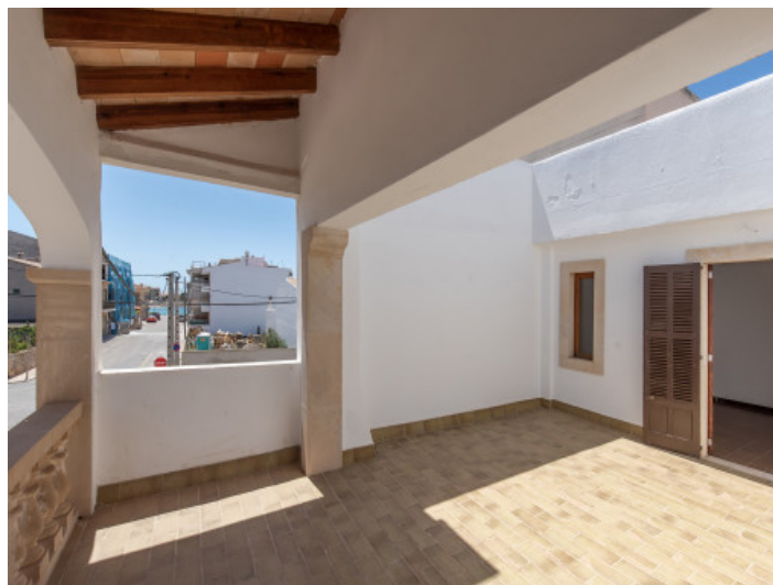
Lateral sea view