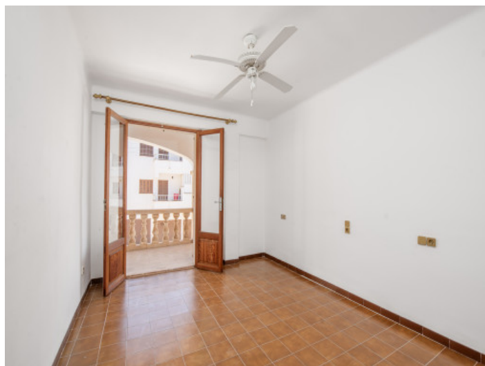
One of 5 bedrooms

All information is correct to the best of our knowledge. Errors and prior sale excepted. This prospectus is purely for information purposes. Only the notarized deed of sale is legally binding.