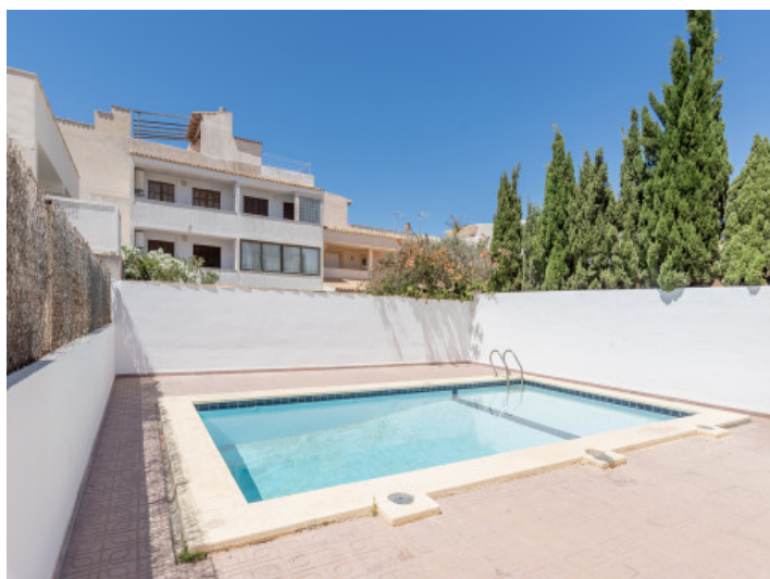
Patio con pool