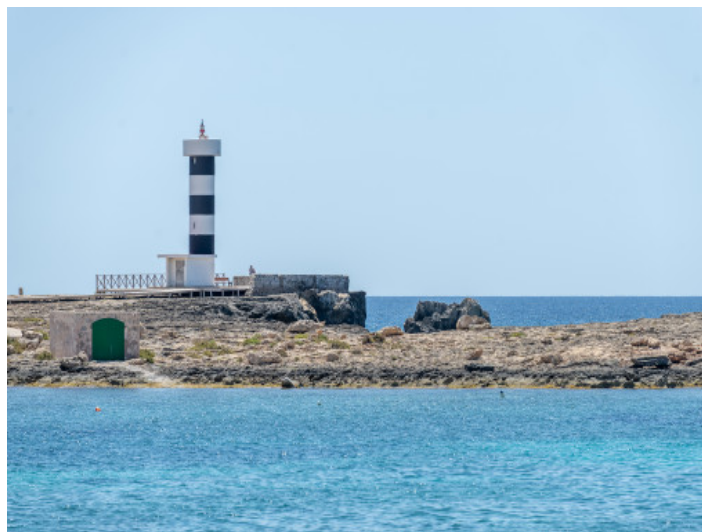
Lighthouse of Cala Gaviota