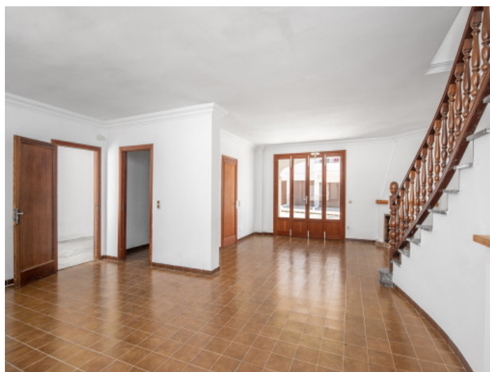
Entrance hall and living area