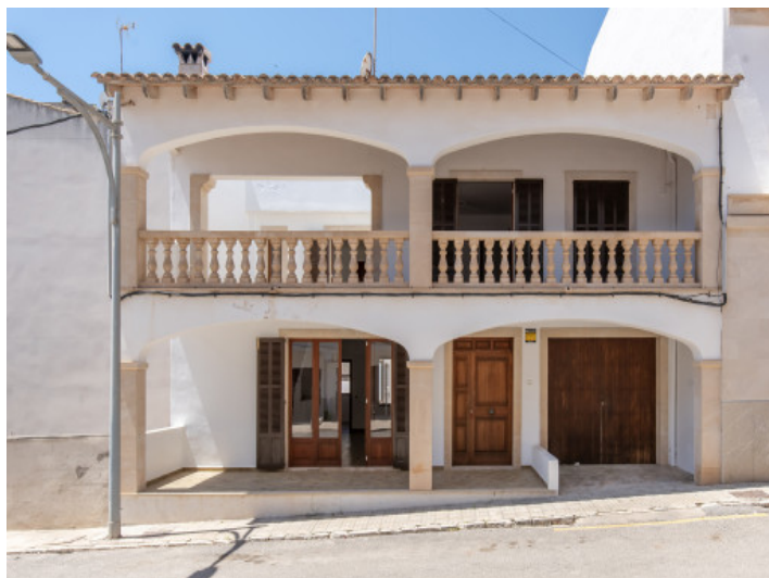
Typical mallorcan southern coastal facade