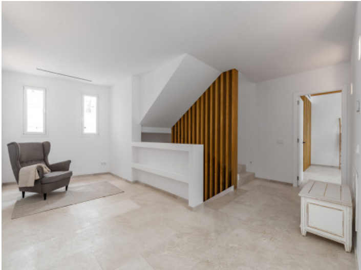
Hall on the first floor