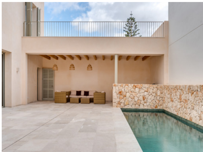
Patio with pool