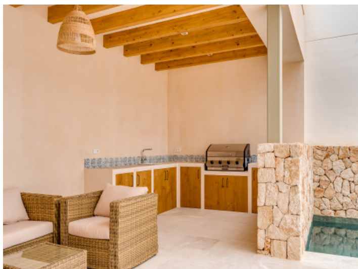
Outdoor kitchen and BBQ