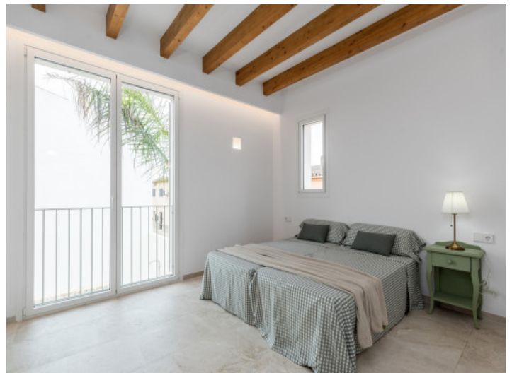
All bedrooms with bathroom en suite

All information is correct to the best of our knowledge. Errors and prior sale excepted. This prospectus is purely for information purposes. Only the notarized deed of sale is legally binding.