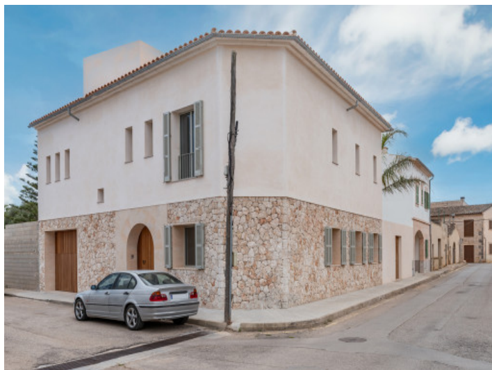
Streetview to the townhouse