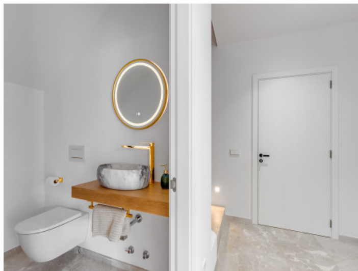
Guest toilet on the ground floor