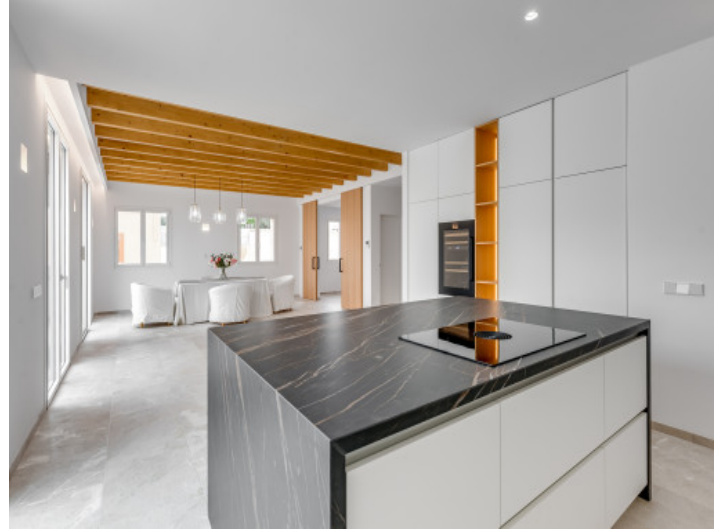
High quality kitchen