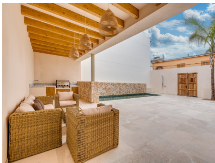
Beautiful patio with pool