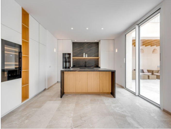
Modern kitchen with kitchen island