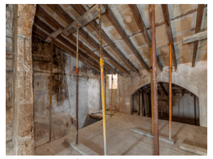
Original wooden beams