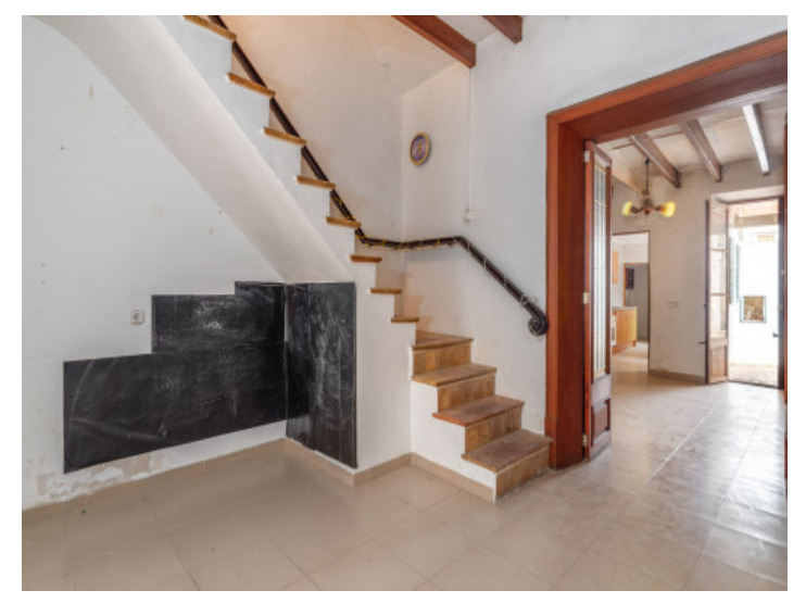
Room on the first floor