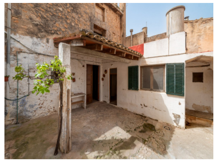
Patio with lots of possibilities