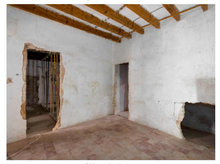
Old wooden beams