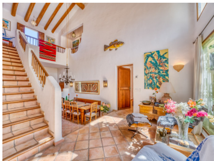
Staircase to the upper floor