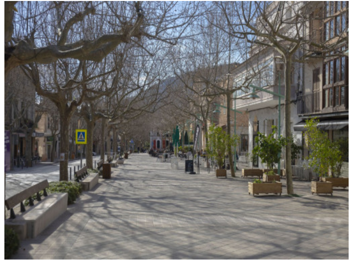
Esporlas is close to Palma