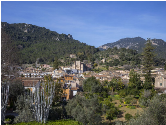
Lovely village of Esporles