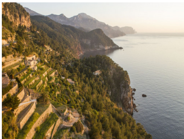
Coastline close to Bañalbufar