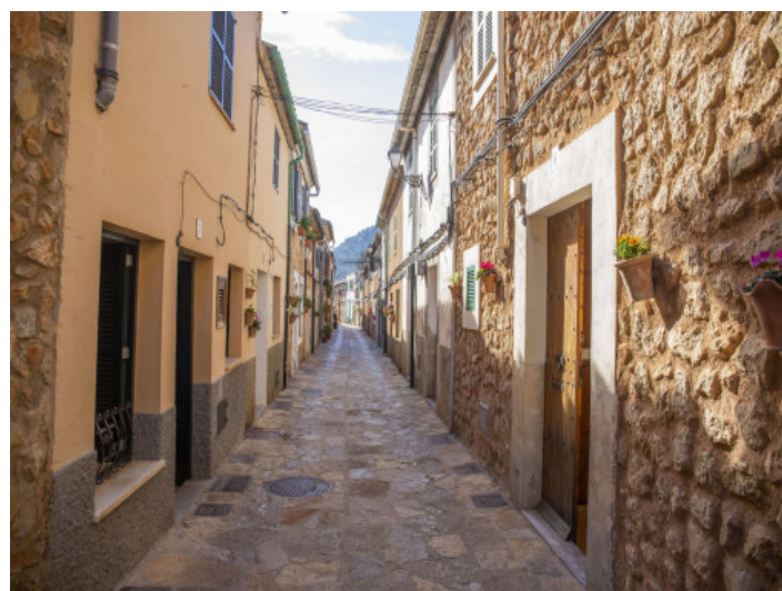
Picturesque street in the village

All information is correct to the best of our knowledge. Errors and prior sale excepted. This prospectus is purely for information purposes. Only the notarized deed of sale is legally binding.