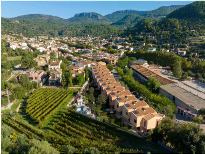
The village of Esporles