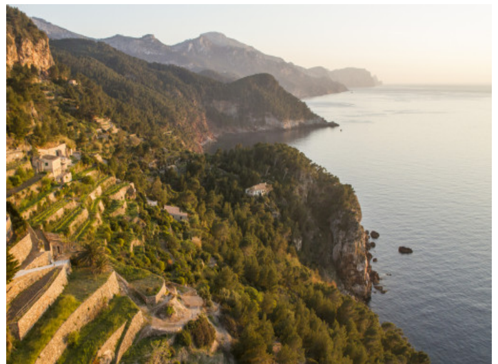
Coast in Bañalbufar

All information is correct to the best of our knowledge. Errors and prior sale excepted. This prospectus is purely for information purposes. Only the notarized deed of sale is legally binding.