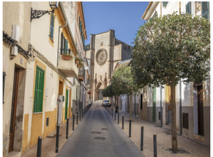
Lovely street in Esporles