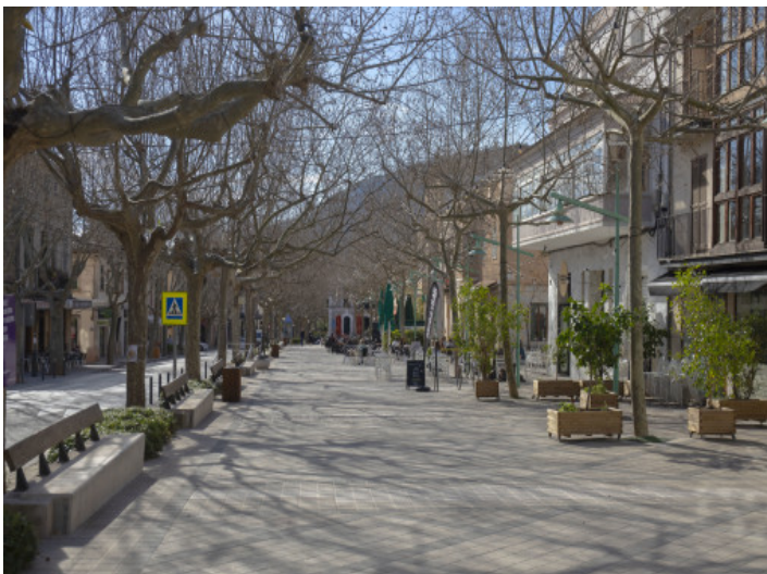
Main street of Esporles