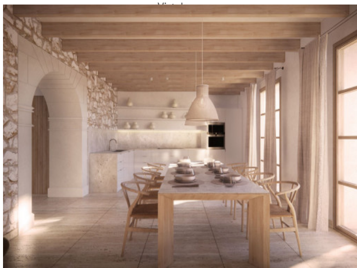
Dining area and kitchen