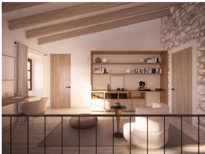
Lounge area on the upper level