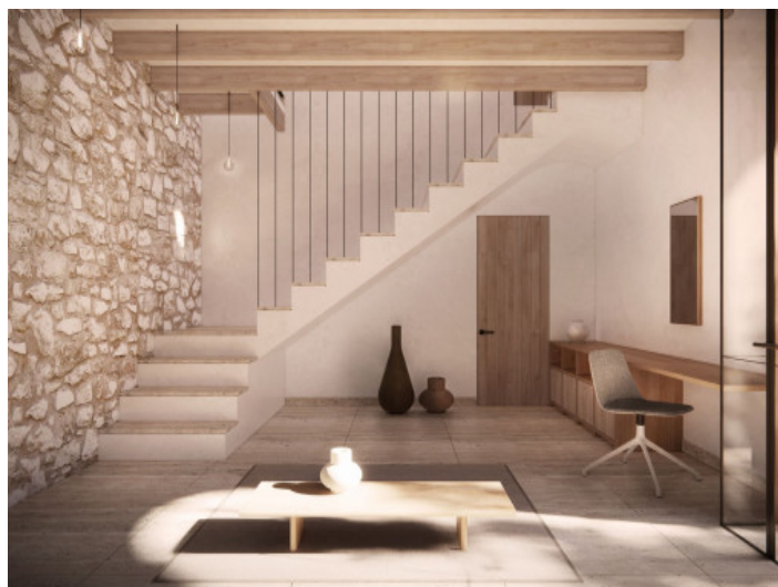
Hall with access to the upper level

All information is correct to the best of our knowledge. Errors and prior sale excepted. This prospectus is purely for information purposes. Only the notarized deed of sale is legally binding.