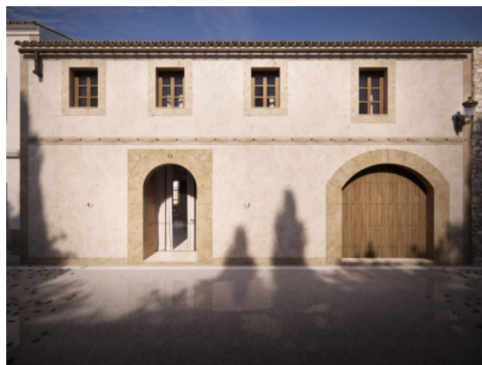
View from the street