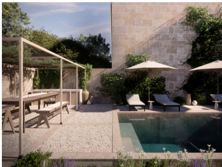
Town-house project with large garden, pool, garage and views in Lloret De