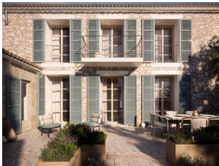
Fachade and terrace