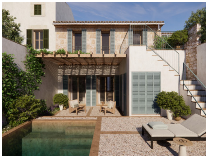
WhatsApp Image 2024-07-08 at 10.47.27-2

All information is correct to the best of our knowledge. Errors and prior sale excepted. This prospectus is purely for information purposes. Only the notarized deed of sale is legally binding.