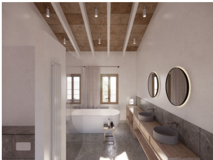
WhatsApp Image 2024-07-08 at 10.47.28-2