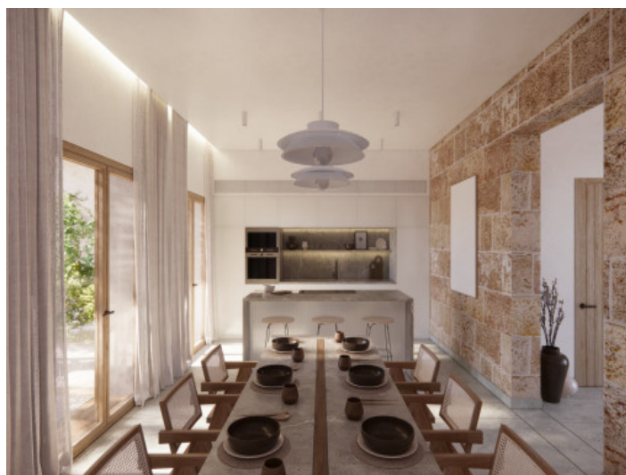
WhatsApp Image 2024-07-08 at 10.47.27-4