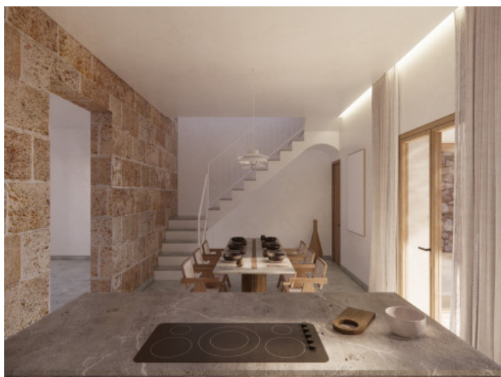
WhatsApp Image 2024-07-08 at 10.47.27-5