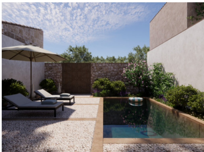
WhatsApp Image 2024-07-08 at 10.47.27-3