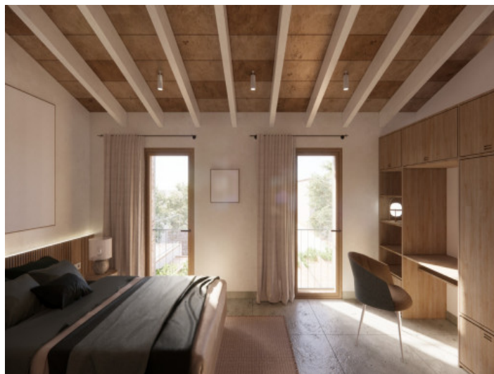
WhatsApp Image 2024-07-08 at 10.47.28