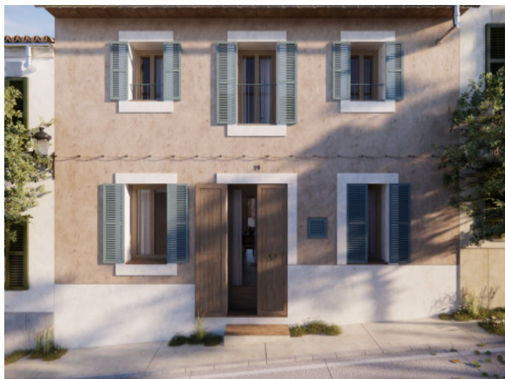
WhatsApp Image 2024-07-08 at 10.47.27

All information is correct to the best of our knowledge. Errors and prior sale excepted. This prospectus is purely for information purposes. Only the notarized deed of sale is legally binding.