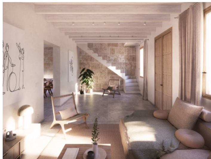
Hall with living area