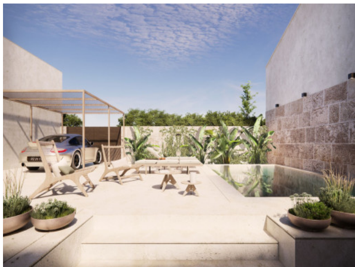
Pool area with sun terrace