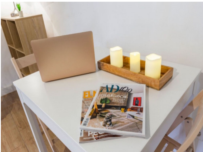
Small dining area