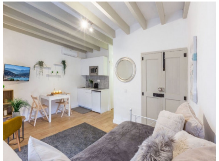
View to the entrance