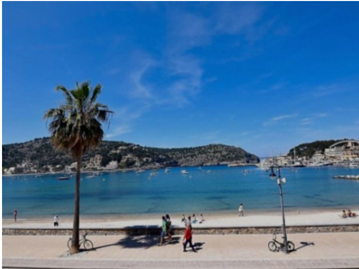
Port de Soller