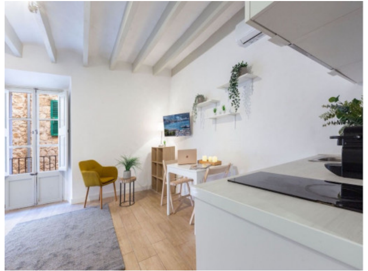
Renovated living area