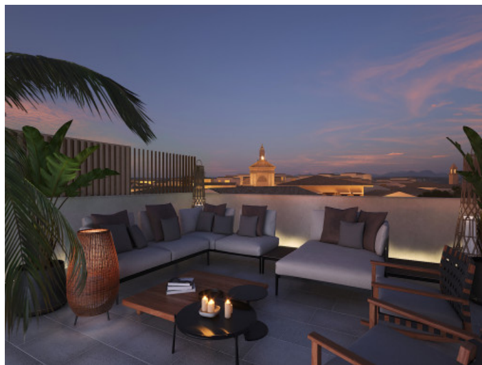
Amazing views from the rooftop