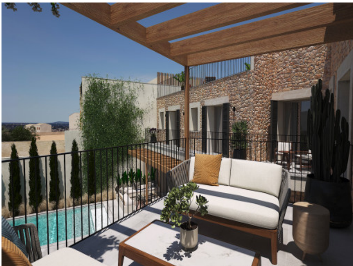
Private terrace of the mastersuite