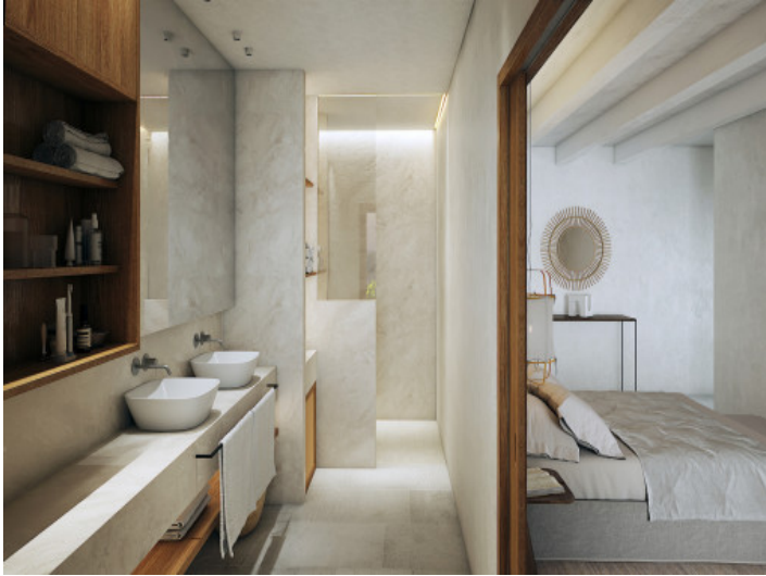
One of 4 bathroom