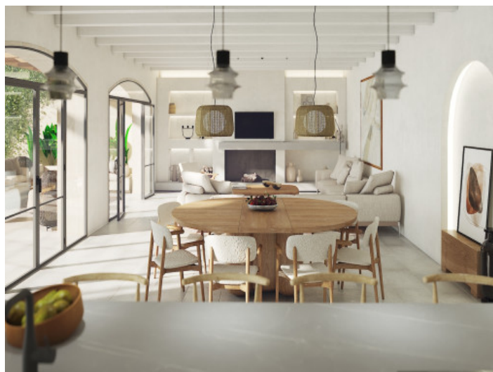
Spacious room design

All information is correct to the best of our knowledge. Errors and prior sale excepted. This prospectus is purely for information purposes. Only the notarized deed of sale is legally binding.