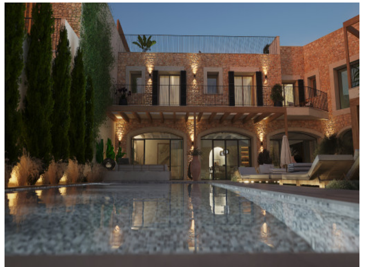
Elegant garden with heated pool