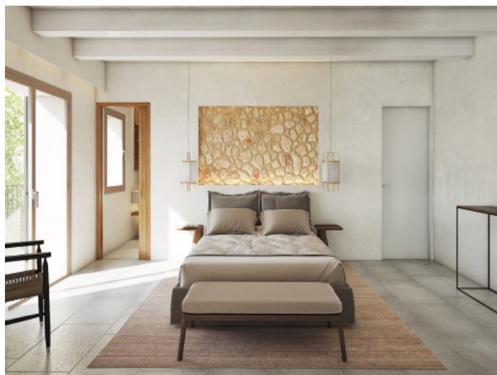
One of 4 bedrooms

All information is correct to the best of our knowledge. Errors and prior sale excepted. This prospectus is purely for information purposes. Only the notarized deed of sale is legally binding.