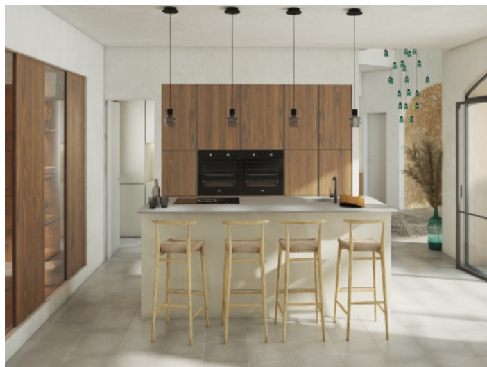
First-class building materials