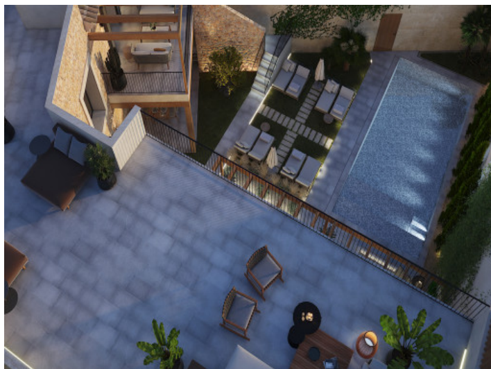
Eagle's eye view