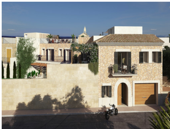
Fassade of this amazing project

All information is correct to the best of our knowledge. Errors and prior sale excepted. This prospectus is purely for information purposes. Only the notarized deed of sale is legally binding.