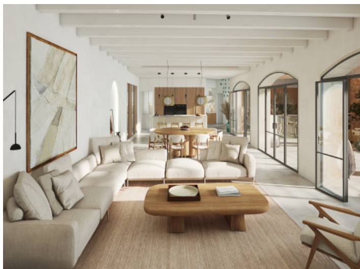
Open plan design