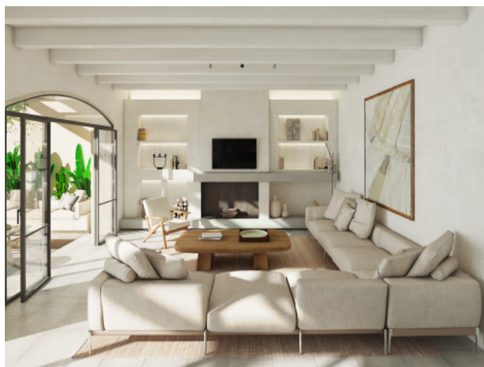
High ceilings, aircondition and underfloor heating