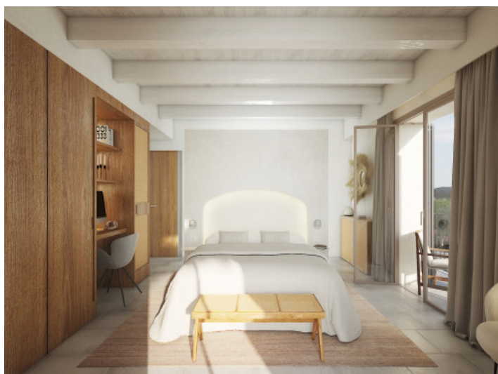
All bedrooms with bathroom en suite