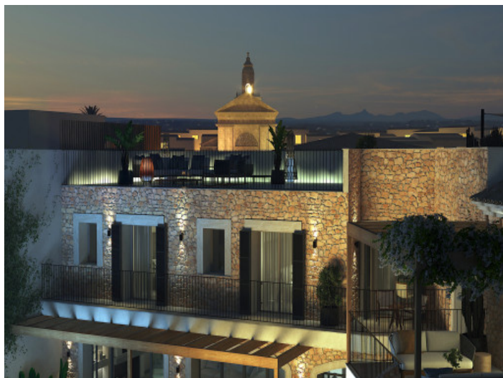
Mallorcan tradition meets modern architecture