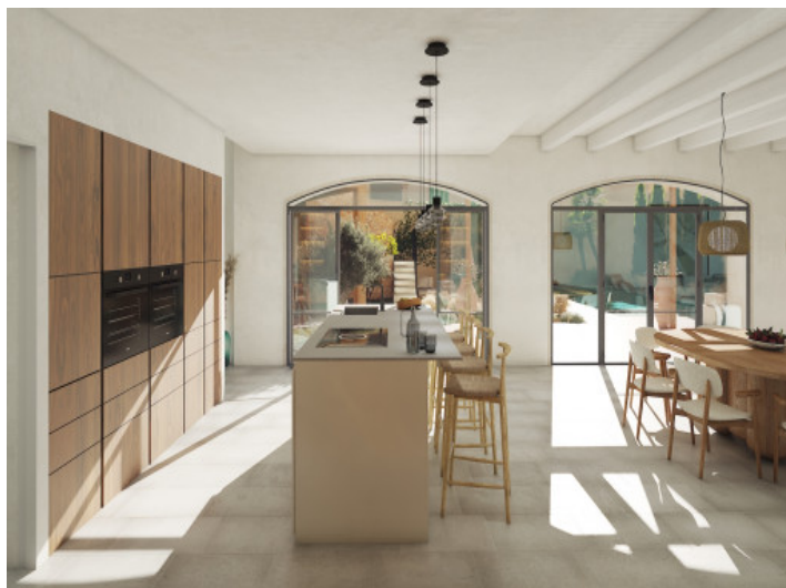
High quality kitchen