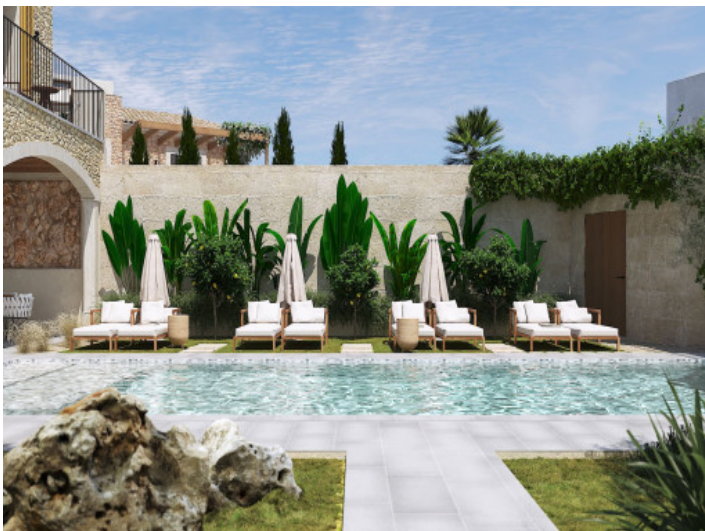
Large pool and garden