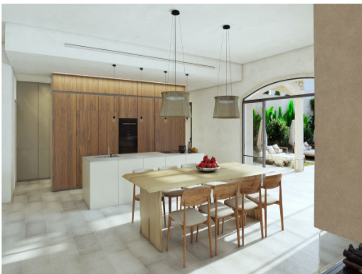
Light-flooded, spacious and open rooms