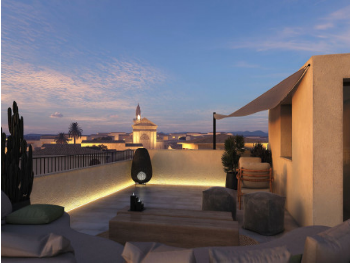
Rooftop terrace with views over the village