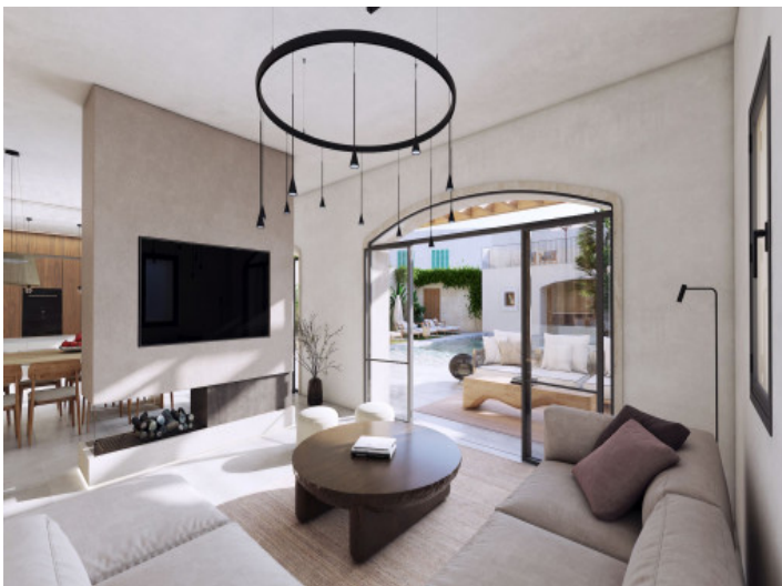
Cozy and relaxed lifestyle