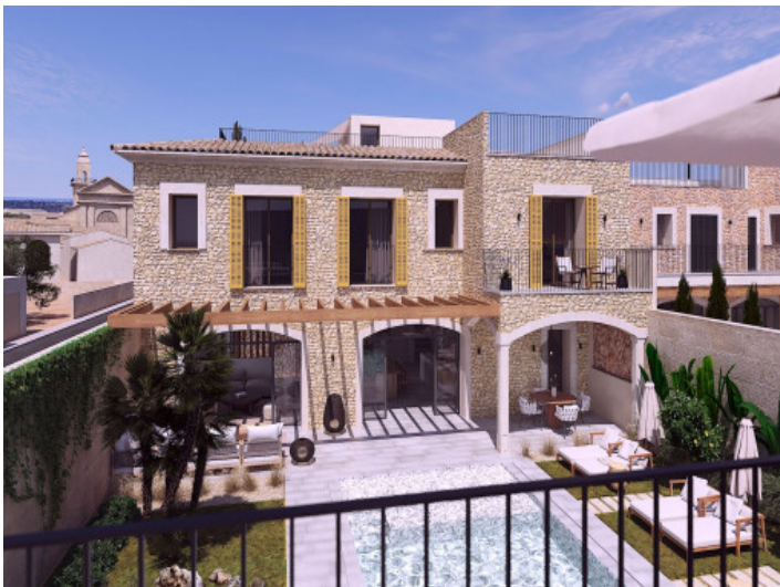
Top location in Ses Salines