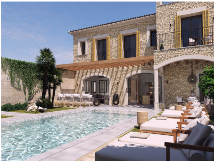
10x4m large Pool