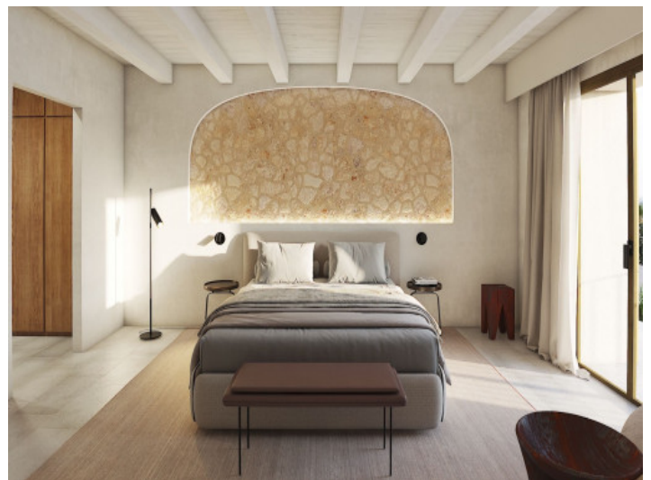
All bedrooms with bath en suite