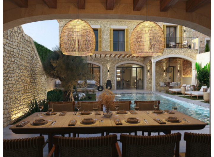
Amazing outdoor area