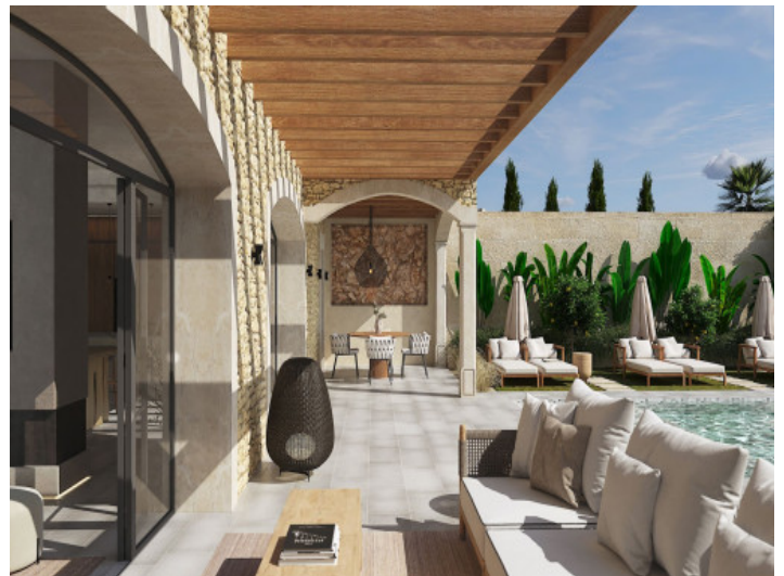
Covered terrace close to the pool