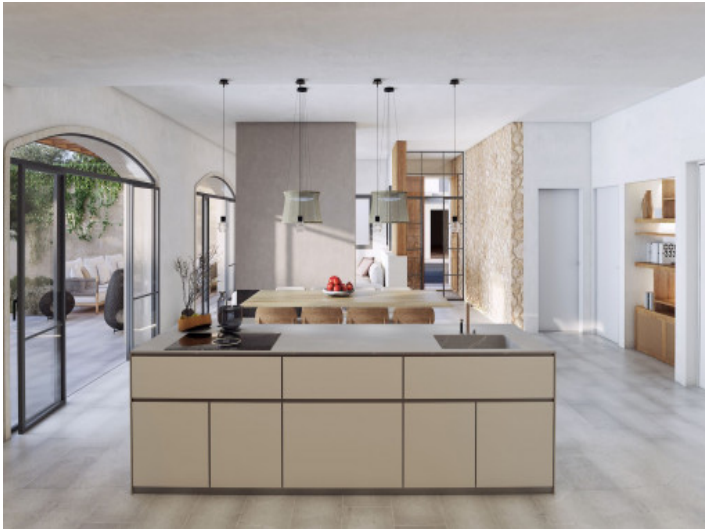
Amazing cook island