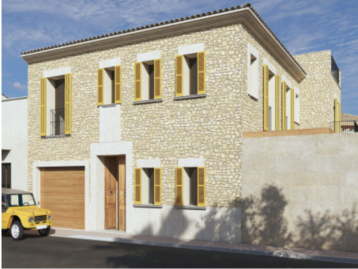
The natural stone facade