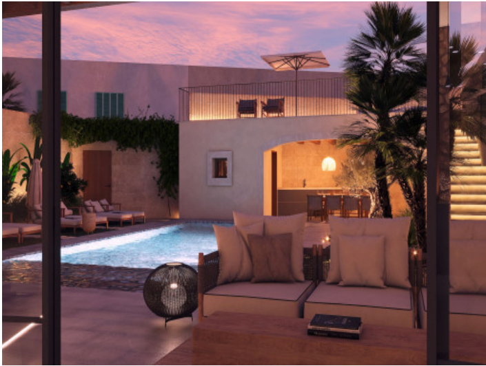
Mallorquin tradition meets modern architecture