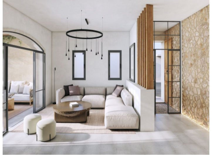
Elegant living area