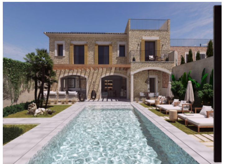
Beautiful pool area

All information is correct to the best of our knowledge. Errors and prior sale excepted. This prospectus is purely for information purposes. Only the notarized deed of sale is legally binding.