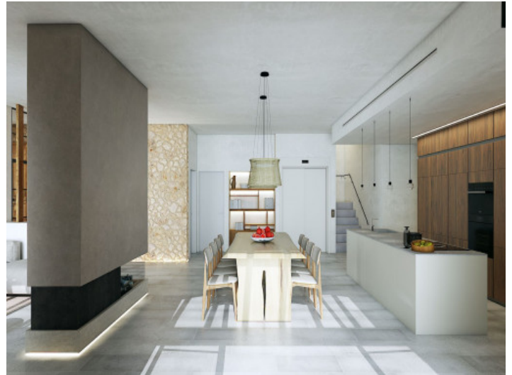
Dining area with fireplace