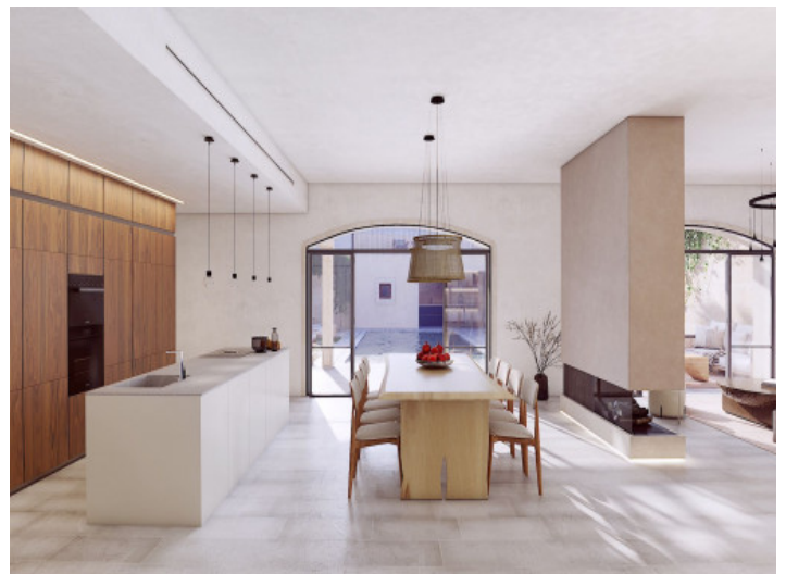
High quality kitchen

All information is correct to the best of our knowledge. Errors and prior sale excepted. This prospectus is purely for information purposes. Only the notarized deed of sale is legally binding.