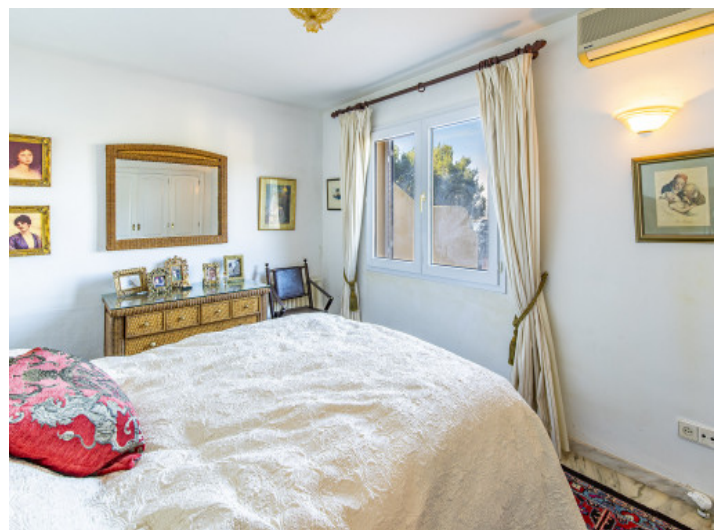
Masterbedroom with bath en suite

All information is correct to the best of our knowledge. Errors and prior sale excepted. This prospectus is purely for information purposes. Only the notarized deed of sale is legally binding.