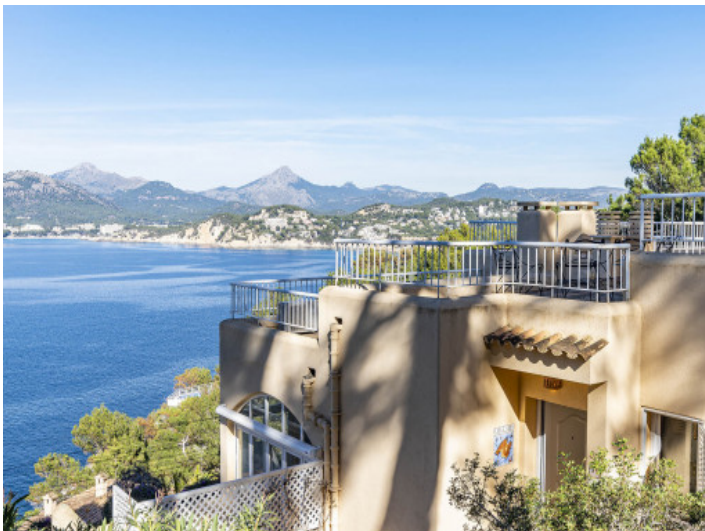
View to the community