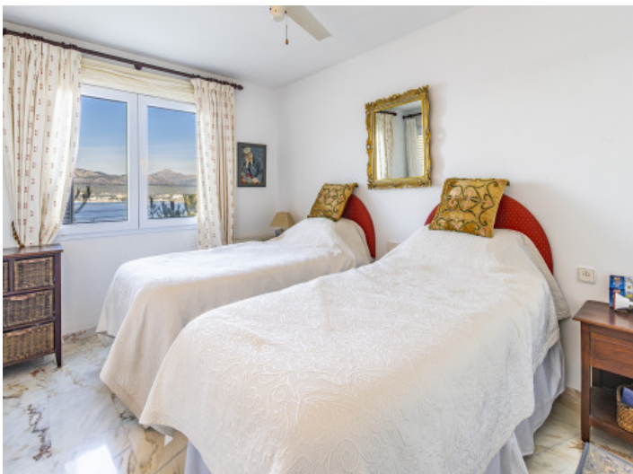
Sunny 2nd bedroom