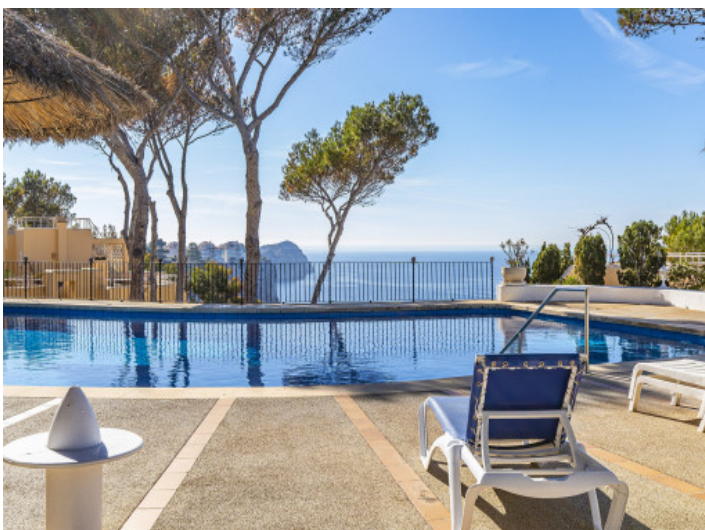
Well-tended community pool