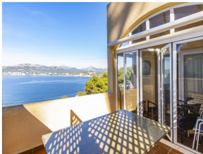
Balcony with amazing sea views