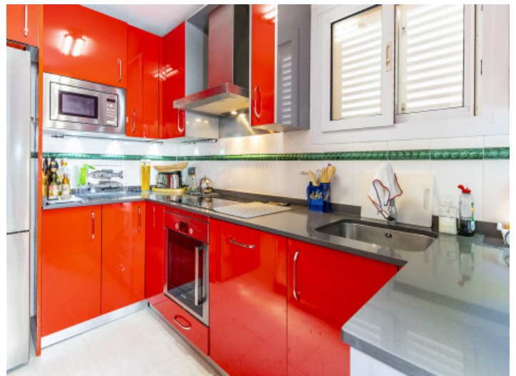
Fully equipped built-in kitchen

All information is correct to the best of our knowledge. Errors and prior sale excepted. This prospectus is purely for information purposes. Only the notarized deed of sale is legally binding.