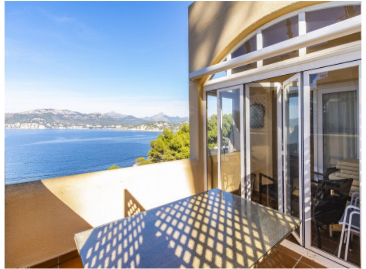
Balcony with amazing sea views