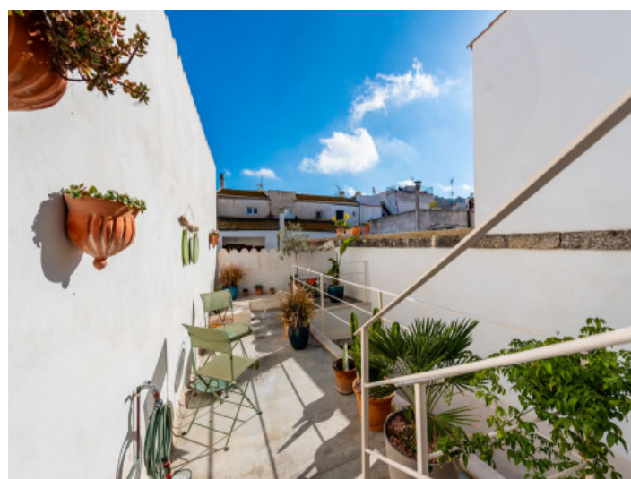
Lovely sun terrace