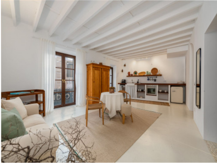
Tastefully renovated apartment