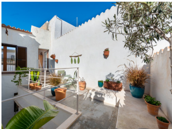
Alternative terrace view

All information is correct to the best of our knowledge. Errors and prior sale excepted. This prospectus is purely for information purposes. Only the notarized deed of sale is legally binding.