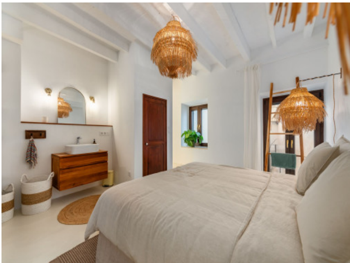
Wonderful bedroom with bathroom