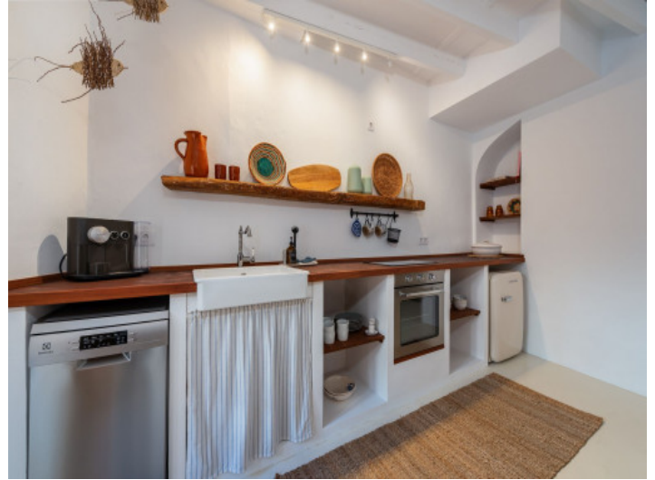
Mallorcan style kitchen