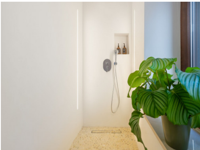
Modern shower bathroom