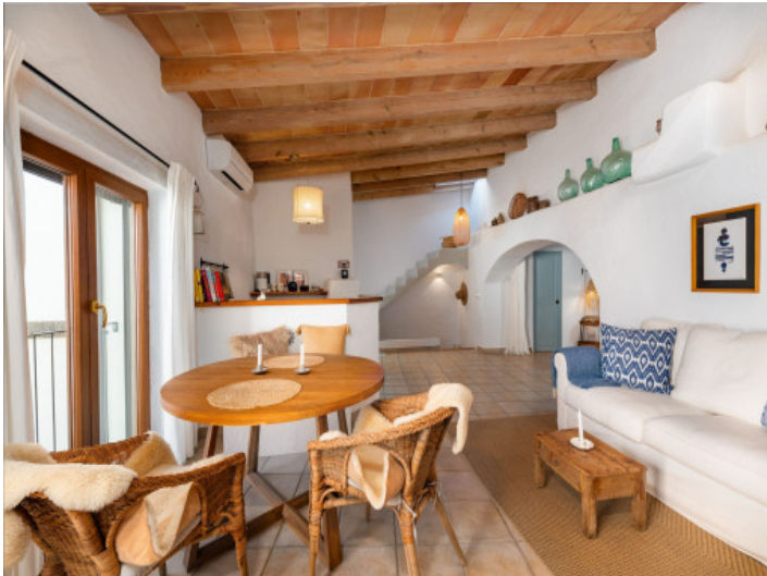
Living area with lots of character