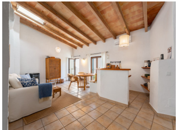
Access to a cozy apartment

All information is correct to the best of our knowledge. Errors and prior sale excepted. This prospectus is purely for information purposes. Only the notarized deed of sale is legally binding.