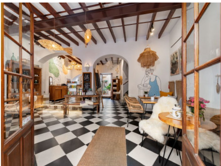
Attractive cafe on the ground floor