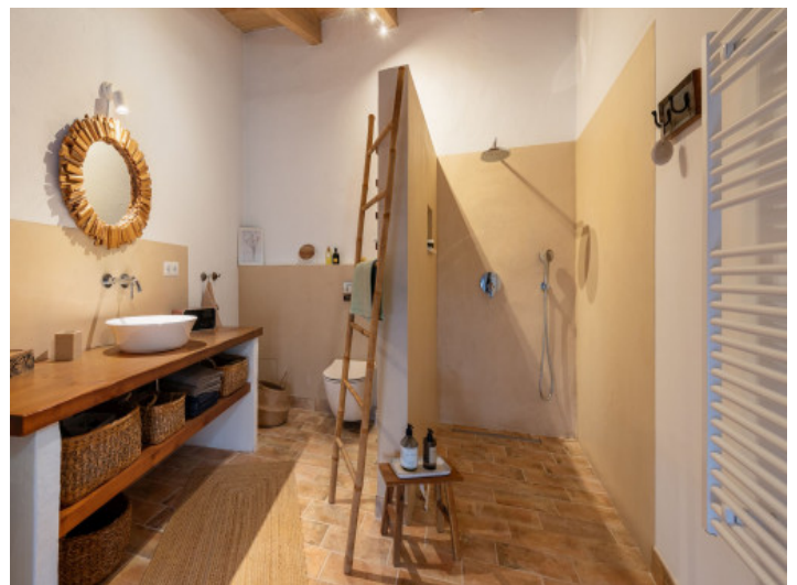
Enchanting shower bathroom