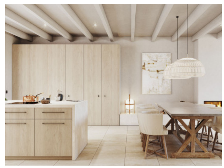
Living area Kitchen All information is correct to the best of our knowledge. Errors and prior sale excepted. This prospectus is purely for information purposes. Only the notarized deed of sale is legally binding.

PORTA MALLORQUINA • THERESIENSTR.: 81, 80333 MUNICH TEL. +34 971 698 242 • INFO@PORTAMALLORQUINA.COM