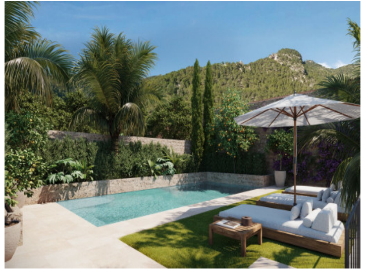
Wonderful pool area