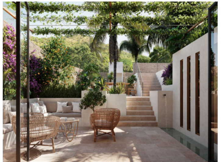
Beautifully laid-out terrace