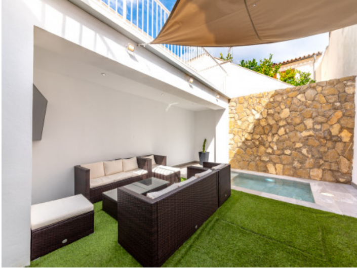
Private courtyard with outdoor dining area and pool