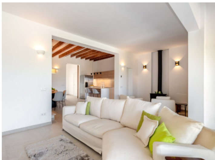
Cosy living area