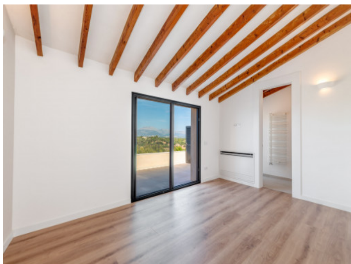
Bedroom with balcony access