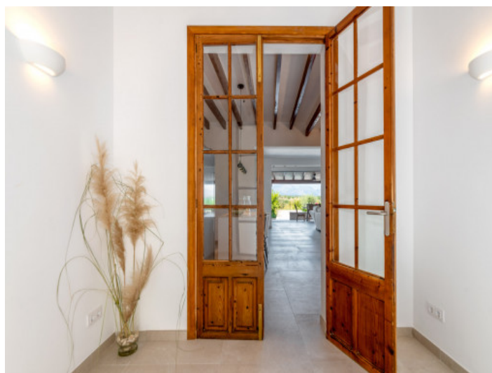
Entrance from the townhouse