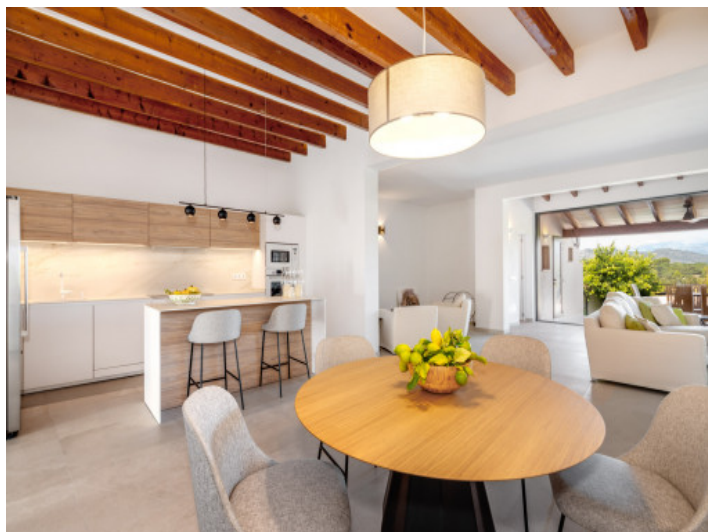
Open dining area

PORTA MALLORQUINA® Your home. Our passion.