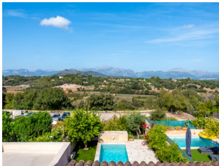
Unique landscape views