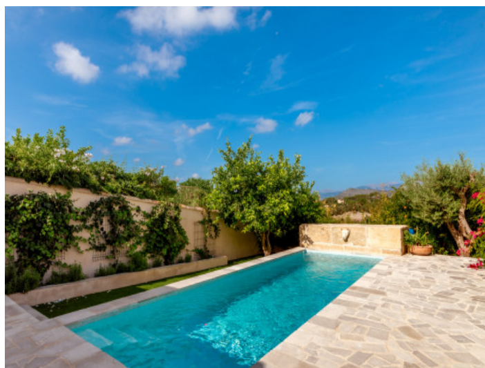
Idyllic pool area