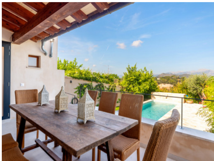
Spacious balcony with garden views