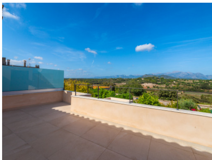
Fantastic roof terrace