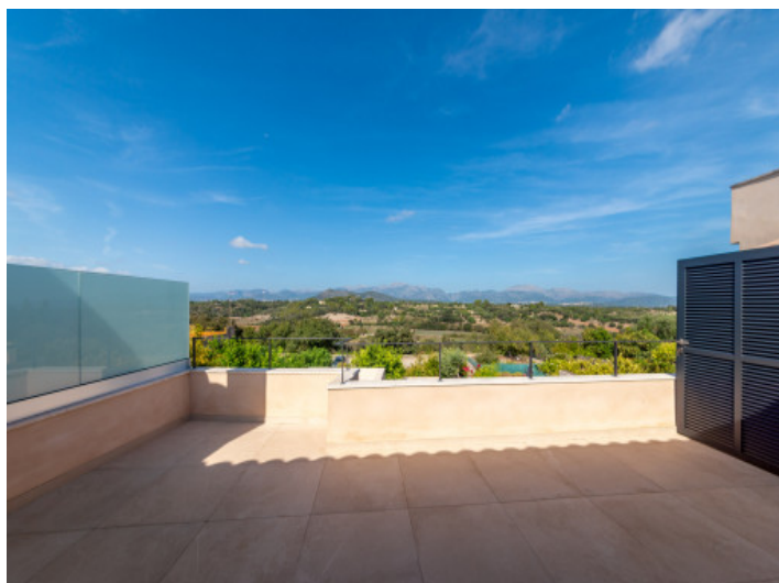
Brilliant views over the landscape