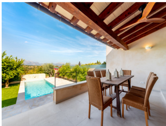
Balcony from the townhouse