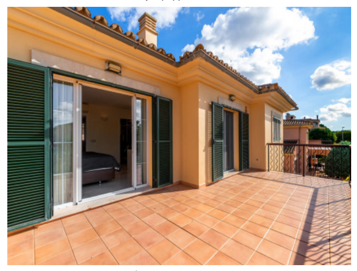
Large sunny terrace