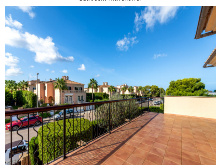
Ample sunny terrace