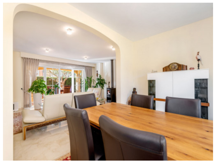
Large dining area

All information is correct to the best of our knowledge. Errors and prior sale excepted. This prospectus is purely for information purposes. Only the notarized deed of sale is legally binding.