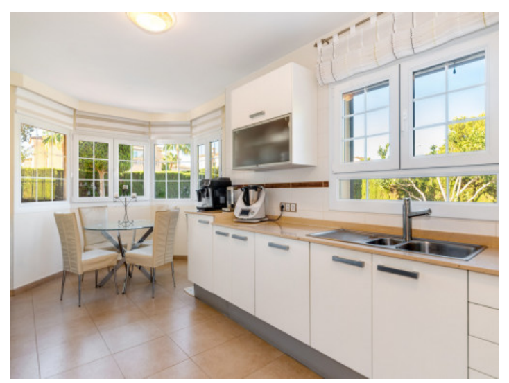
Modern, live-in kitchen