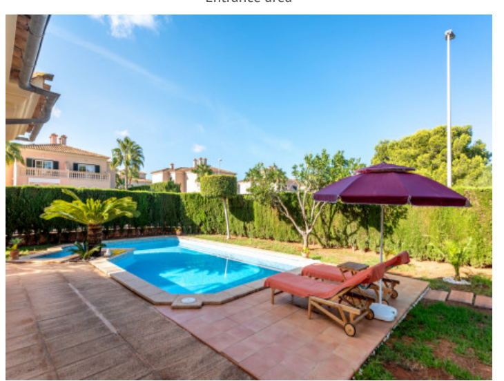
Lovely pool area