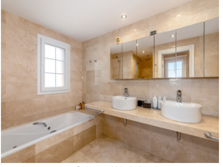
Bathroom with bathtub

All information is correct to the best of our knowledge. Errors and prior sale excepted. This prospectus is purely for information purposes. Only the notarized deed of sale is legally binding.