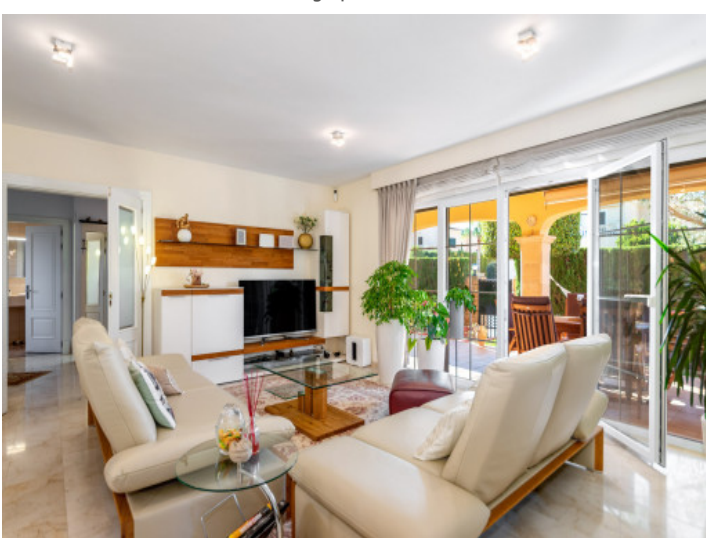
Living area with access to a terrace