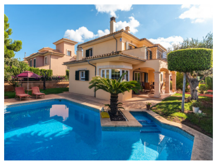
Mediterranean villa with garden and pool in Puig de Ros