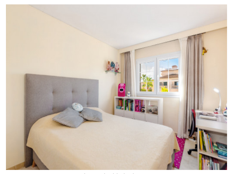
Large double bedroom