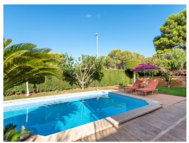
Large pool area