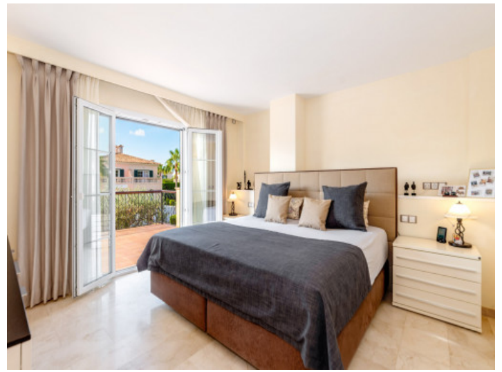
Master bedroom with access to a terrace