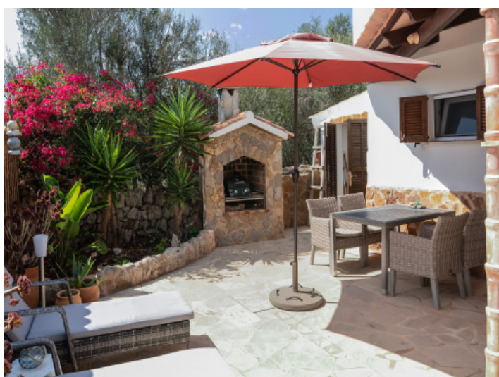
Outdoor dining area with barbecue