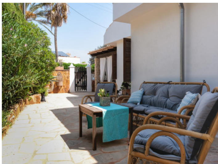
Terrace with outdoor lounge