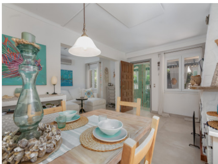
Dining area with fireplace