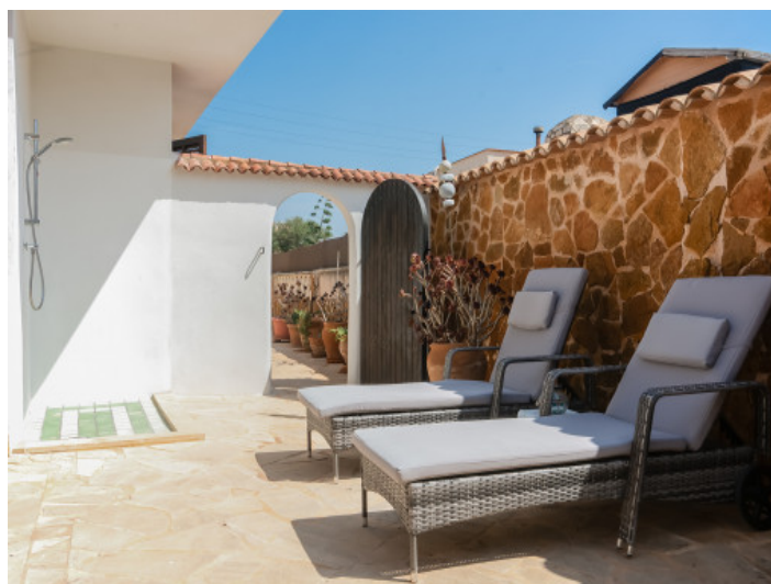
Sunny terrace with exterior shower