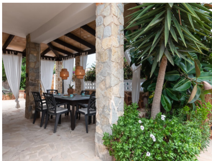
Covered terrace with dining table