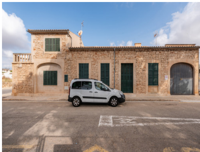
Exterior view of the townhouse