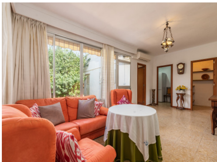
Bright living area with patio access