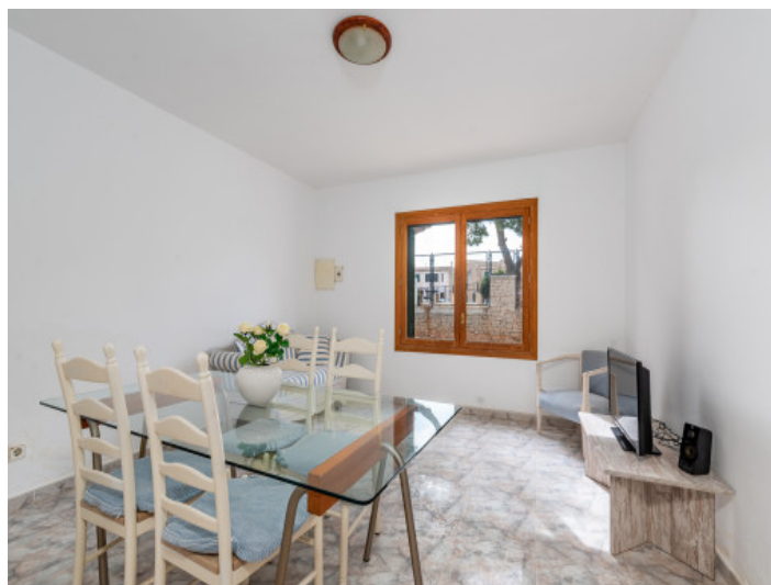
Living area on the upper floor

All information is correct to the best of our knowledge. Errors and prior sale excepted. This prospectus is purely for information purposes. Only the notarized deed of sale is legally binding.