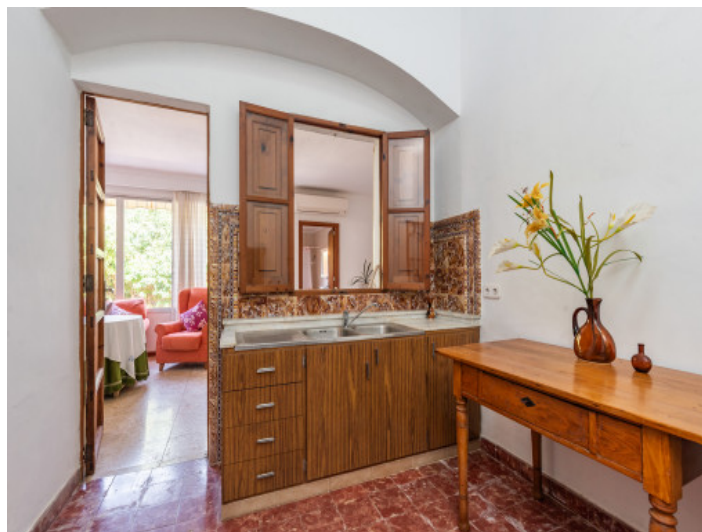
Access to a small kitchen