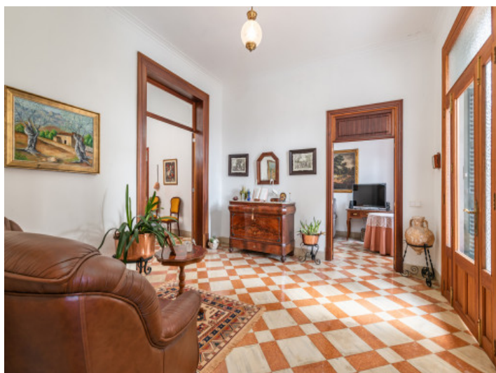
Traditional entrance to the house