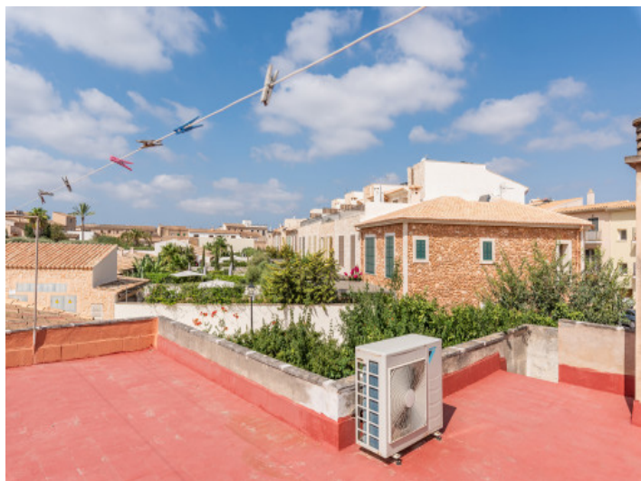
Large roof terrace