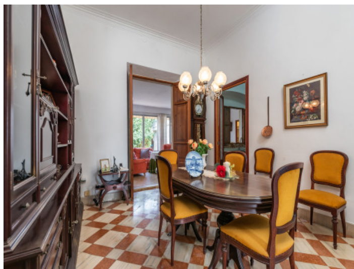
Access to the dining area