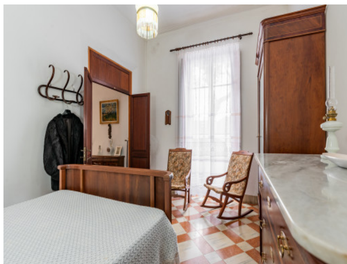
Bedroom on the ground floor