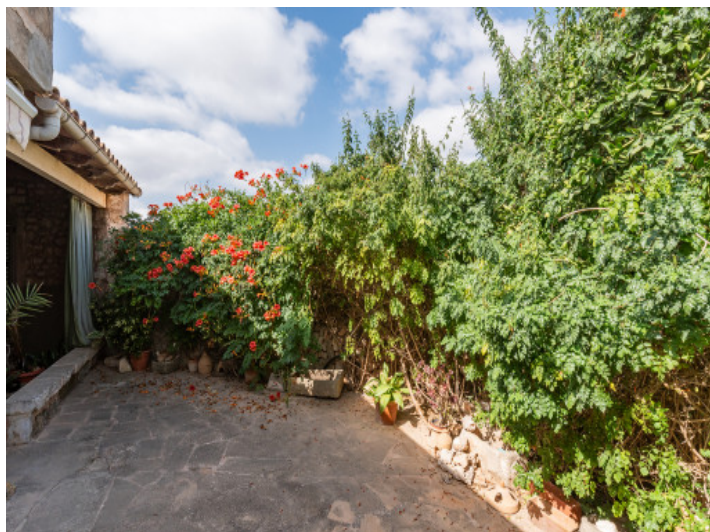
Adjoining outdoor terrace