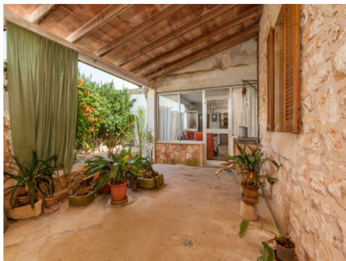
Large covered terrace

All information is correct to the best of our knowledge. Errors and prior sale excepted. This prospectus is purely for information purposes. Only the notarized deed of sale is legally binding.