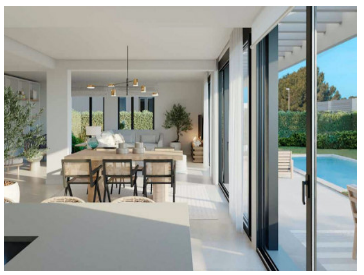
Living and dining area with terrace access