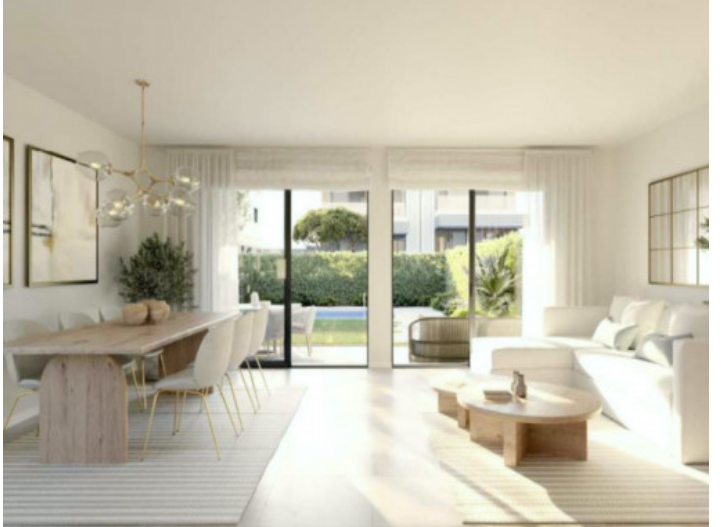
Spacious living and dining area Live-in kitchen All information is correct to the best of our knowledge. Errors and prior sale excepted. This prospectus is purely for information purposes. Only the notarized deed of sale is legally binding.