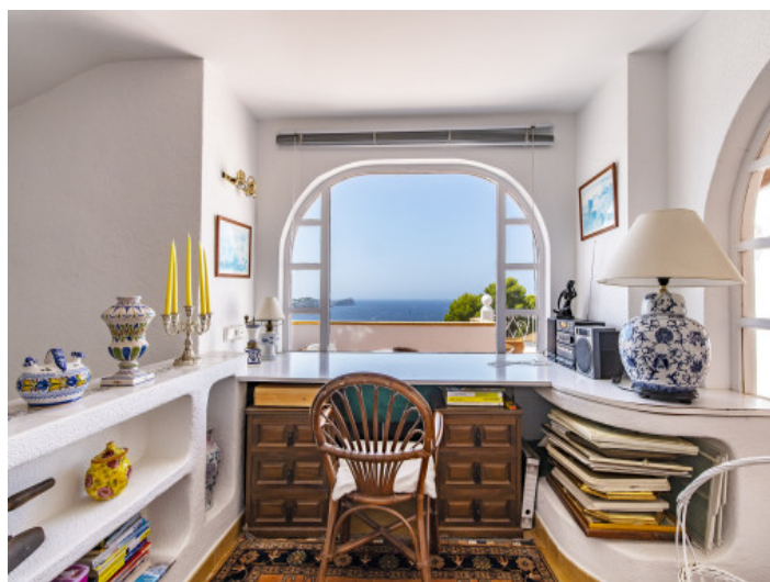
Office with sea views