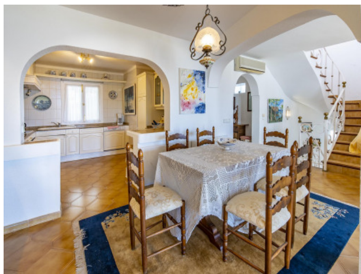
Views from the dining area to the kitchen