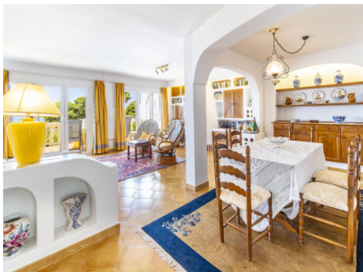
Open dining area