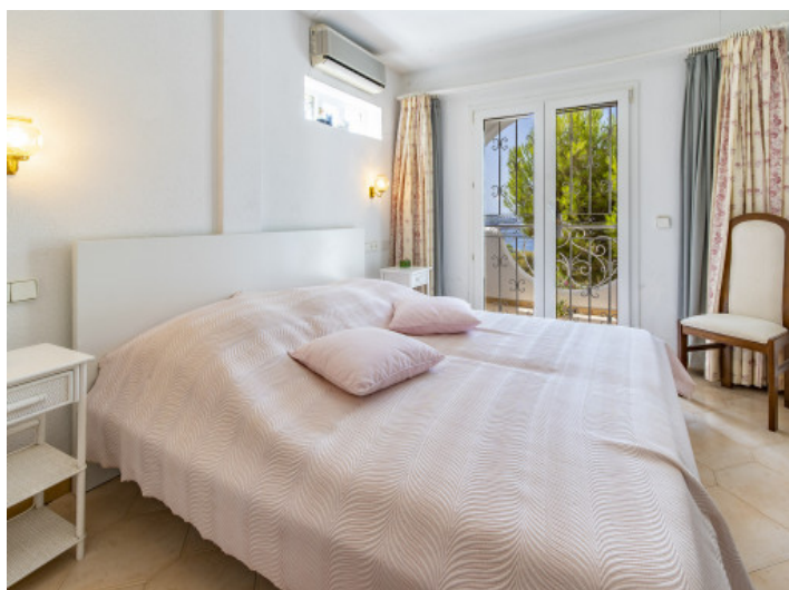
Bedroom with floor to ceiling windows