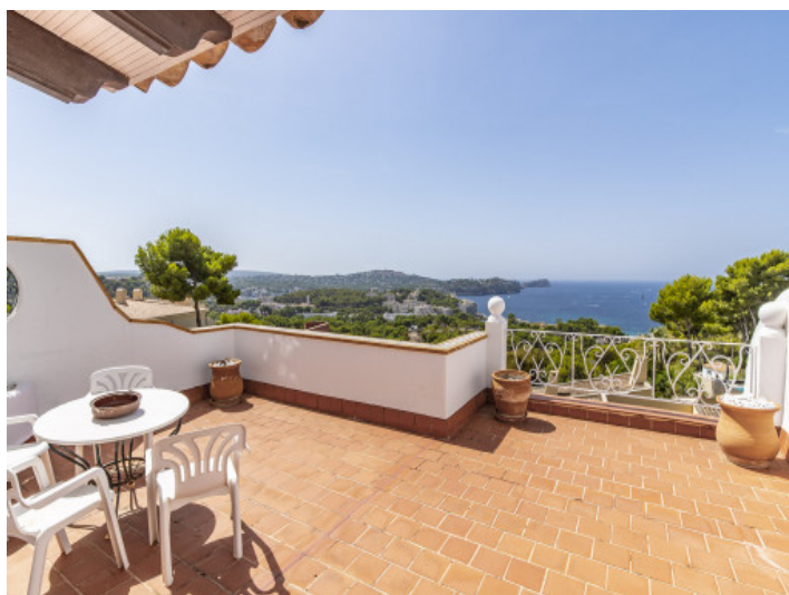
Terrace with sea views