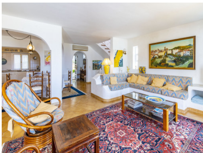
Living area with views to the floor