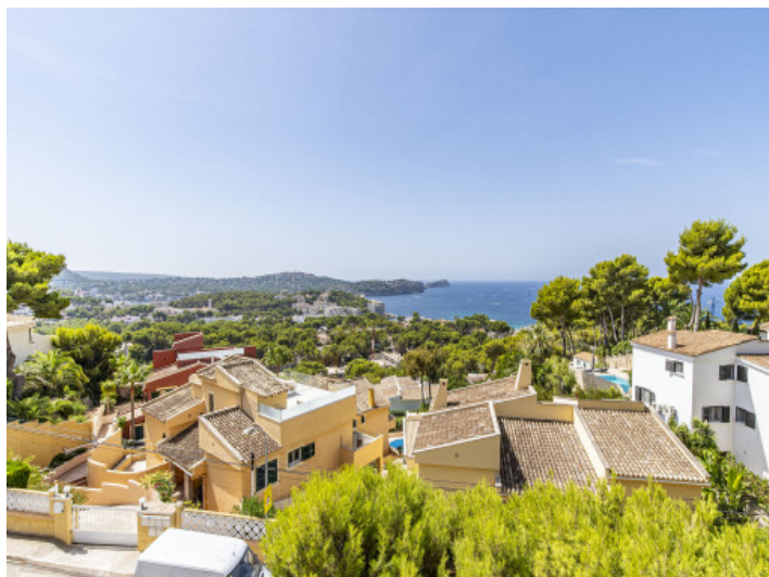
Unique mediterranean sea views