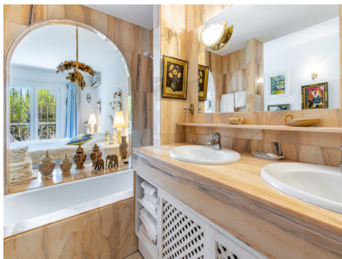
Bright bathroom with bathtub