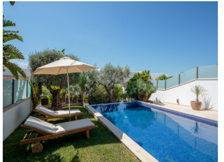
Fantastic pool area with privacy Large swimming pool All information is correct to the best of our knowledge. Errors and prior sale excepted. This prospectus is purely for information purposes. Only the notarized deed of sale is legally binding.

PORTA MALLORQUINA • THERESIENSTR.: 81, 80333 MUNICH TEL. +34 971 698 242 • INFO@PORTAMALLORQUINA.COM