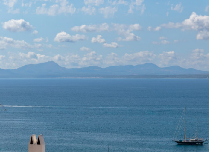
Breathtaking sea and mountain views

All information is correct to the best of our knowledge. Errors and prior sale excepted. This prospectus is purely for information purposes. Only the notarized deed of sale is legally binding.