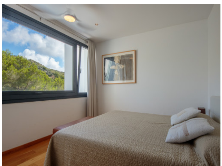
One of 4 bedrooms One of 4 bedrooms All information is correct to the best of our knowledge. Errors and prior sale excepted. This prospectus is purely for information purposes. Only the notarized deed of sale is legally binding.