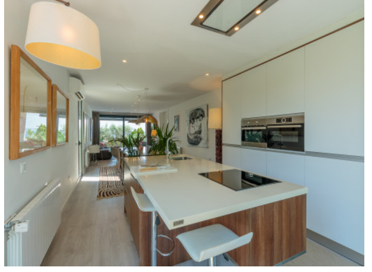
Modern, fully equipped kitchen