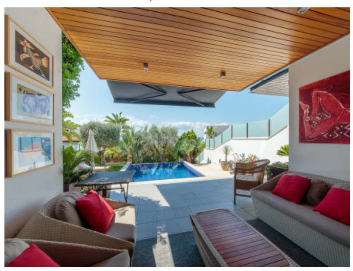
Covered terrace overlooking the pool