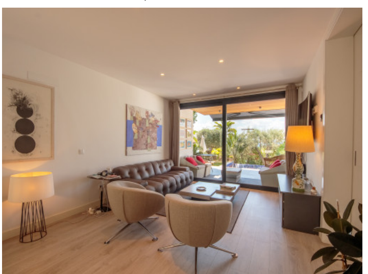
Living area Open living and dining area All information is correct to the best of our knowledge. Errors and prior sale excepted. This prospectus is purely for information purposes. Only the notarized deed of sale is legally binding.

PORTA MALLORQUINA • THERESIENSTR.: 81, 80333 MUNICH TEL. +34 971 698 242 • INFO@PORTAMALLORQUINA.COM