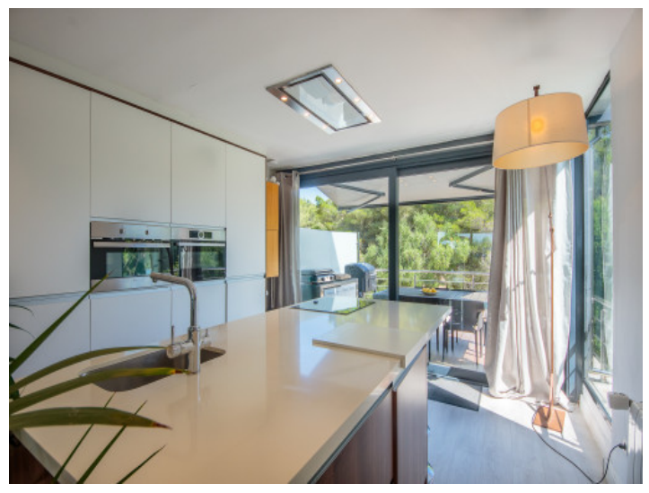
Kitchen with island and access to a terrace