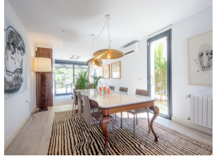
Luxurious dining area

PORTA MALLORQUINA® Your home. Our passion.