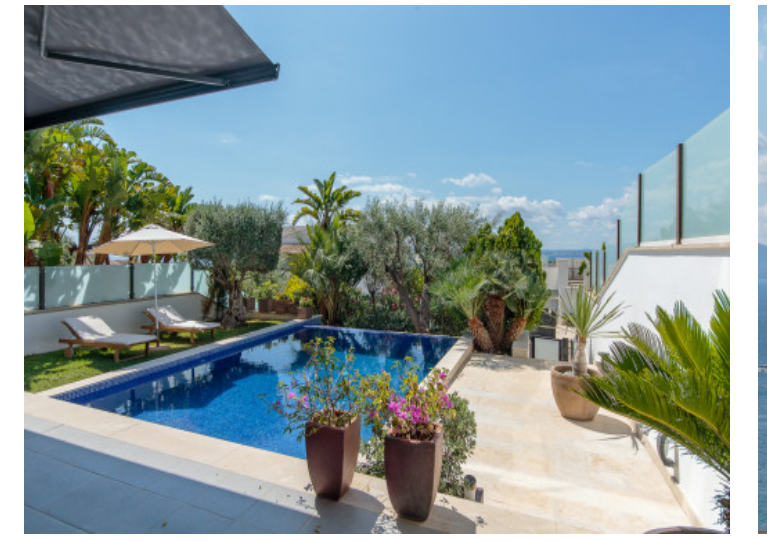
Beautiful pool area

PORTA MALLORQUINA® Your home. Our passion.