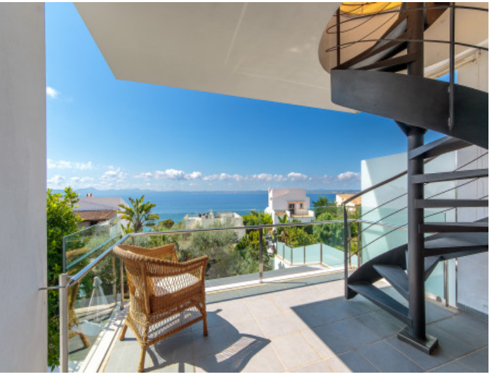
Superb sea views