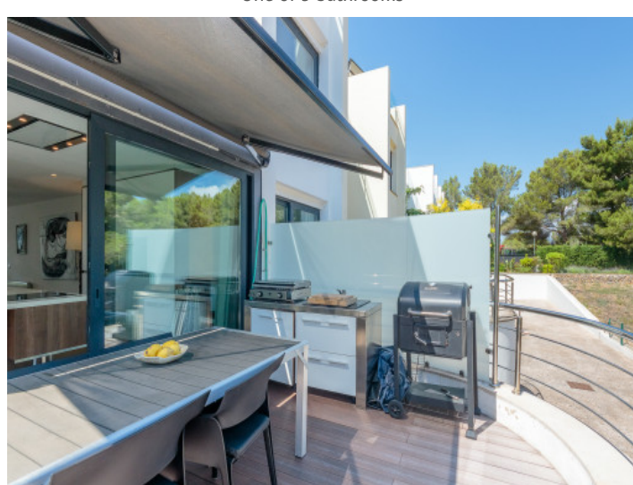
Terrace with barbecue area and awning