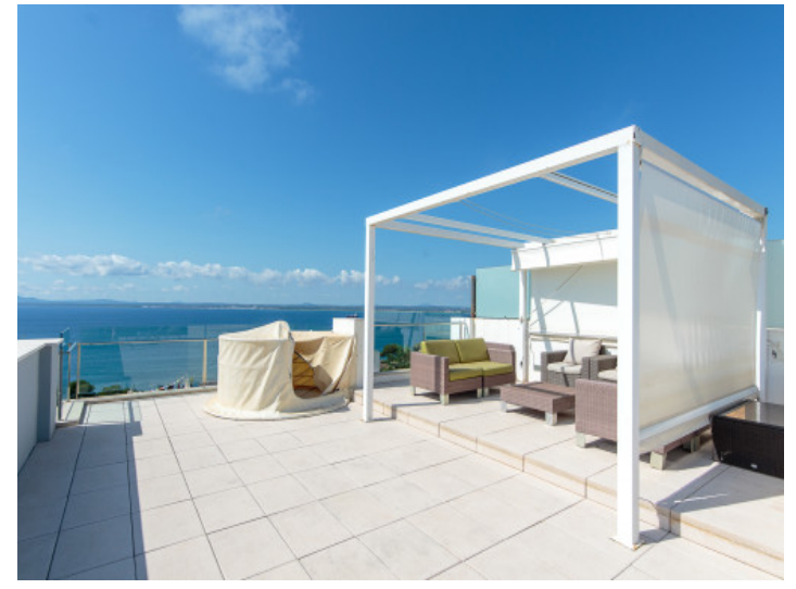
Roof terrace with impressive sea views and chill-out area