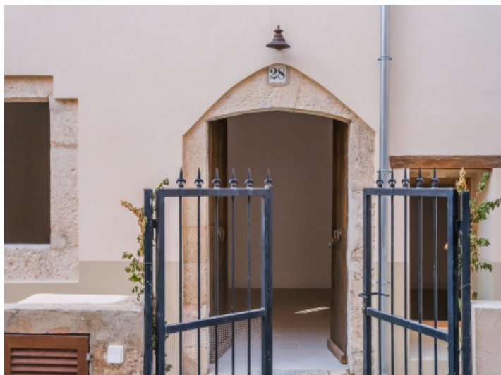
Entrance to the house