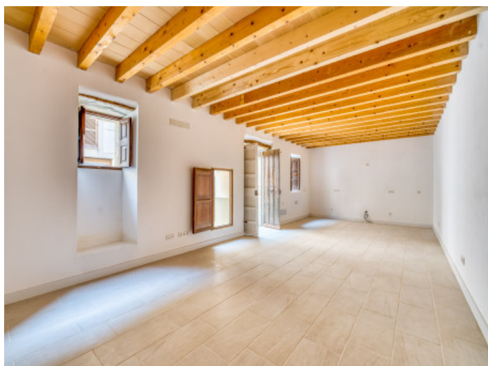
Modern living area