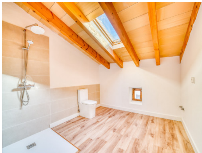
Bathroom with daylight and shower

All information is correct to the best of our knowledge. Errors and prior sale excepted. This prospectus is purely for information purposes. Only the notarized deed of sale is legally binding.