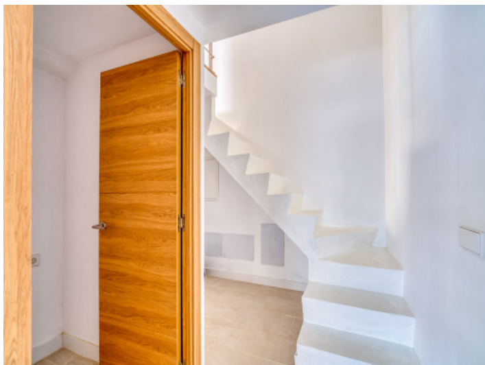
Staircase leads to the upper floor