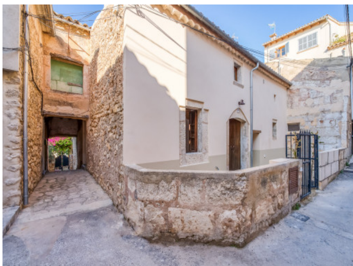
Views from the street to the townhouse

All information is correct to the best of our knowledge. Errors and prior sale excepted. This prospectus is purely for information purposes. Only the notarized deed of sale is legally binding.