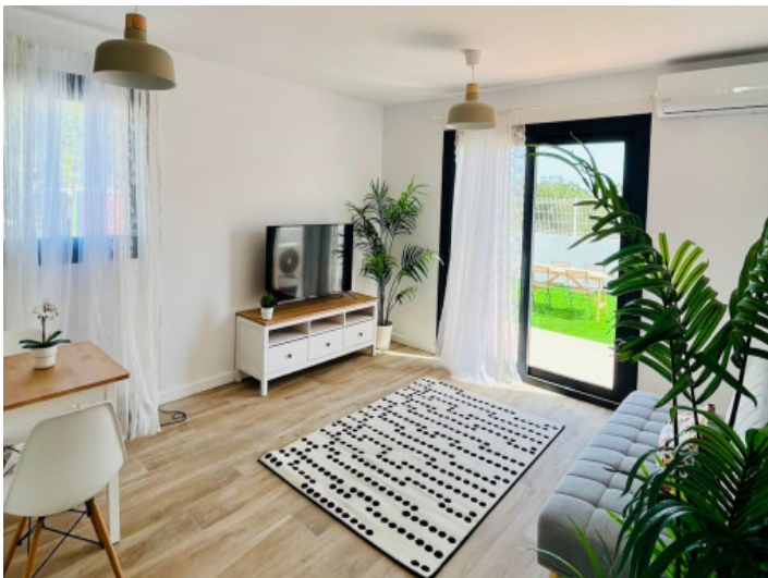
Living area with access to the terrace