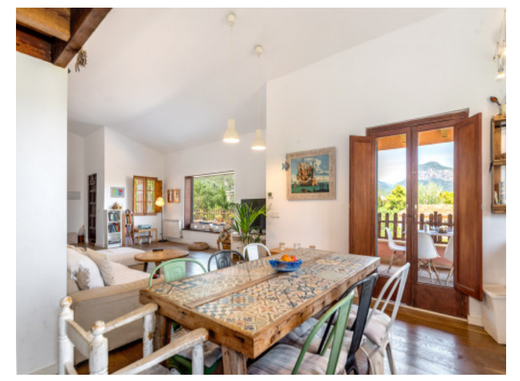
Dining area with access to the terrace

All information is correct to the best of our knowledge. Errors and prior sale excepted. This prospectus is purely for information purposes. Only the notarized deed of sale is legally binding.