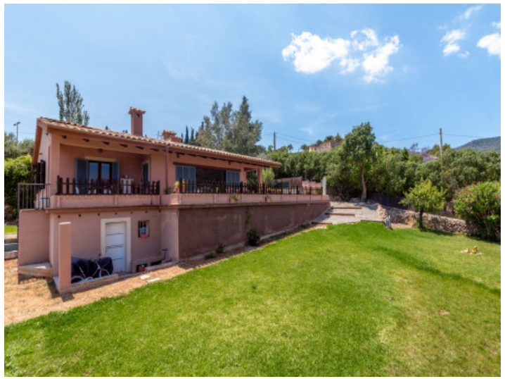
2-storey country house