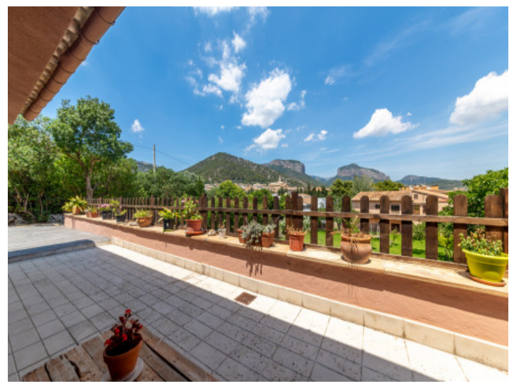
Large covered terrace