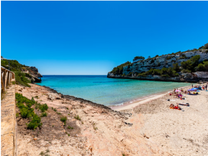
Beach close to the house