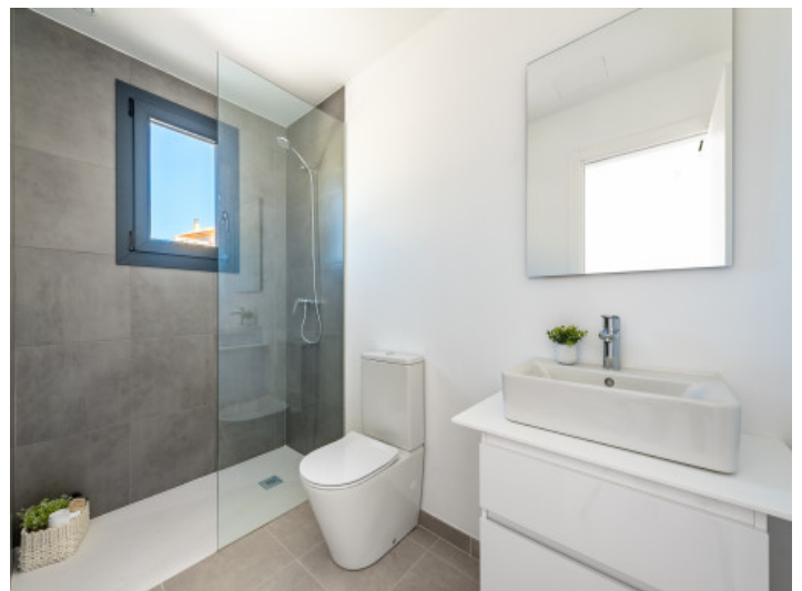
Bathroom en suite