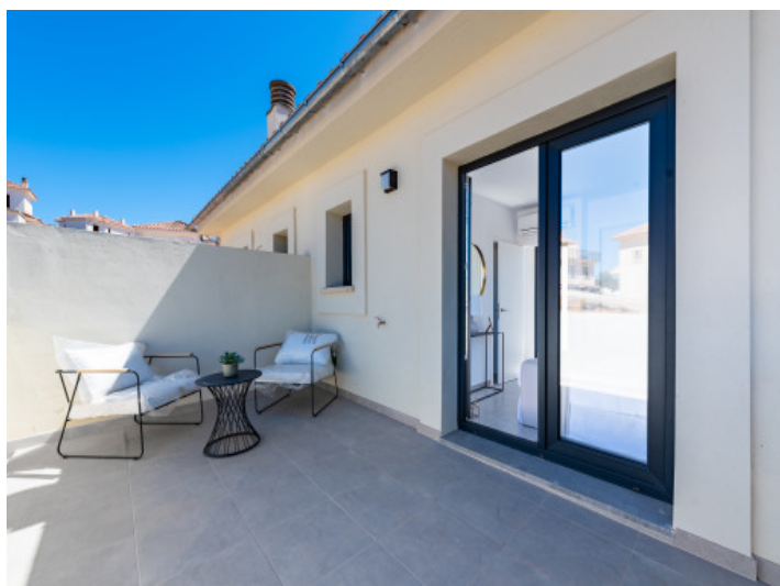
Terrace on the upper floor