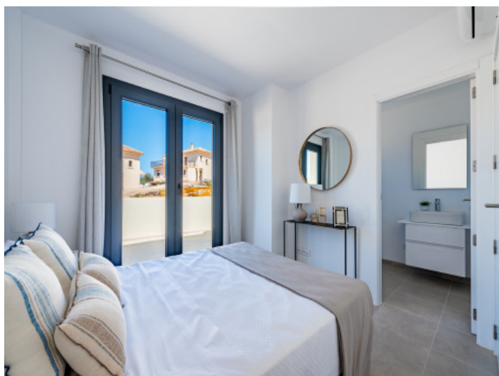
Masterbedroom with bath en suite