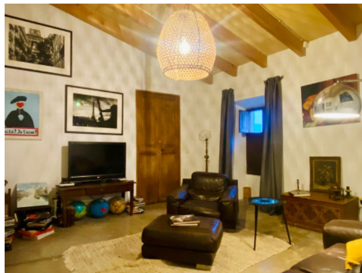
Further living room