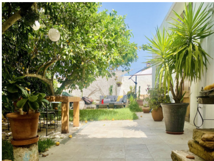
Beautifully planted garden