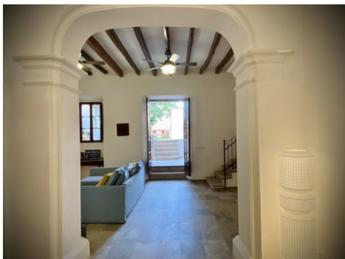
Living area with garden access