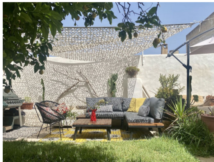
Idyllic lounge area in the garden