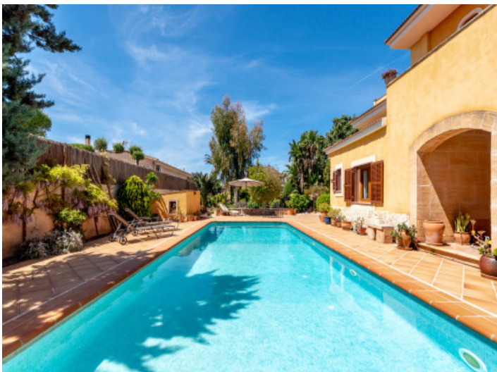
Pool and garden area