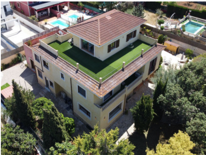
Exterior view of the villa