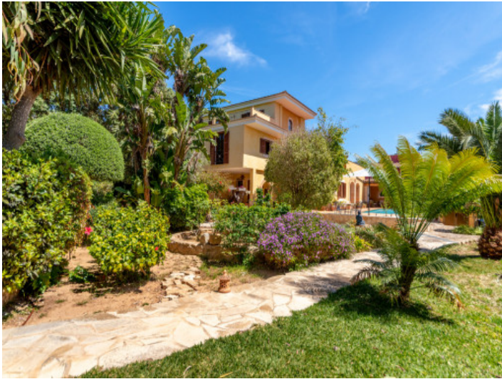
Garden and exterior area of the townhouse