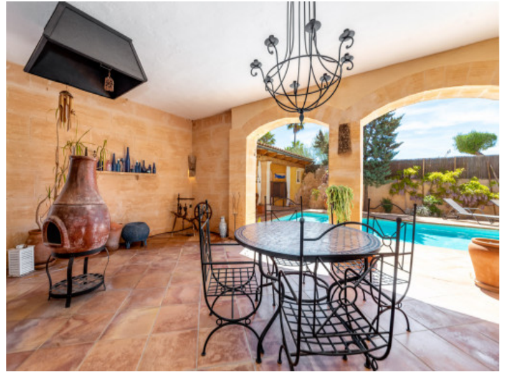
Covered terrace with dining area