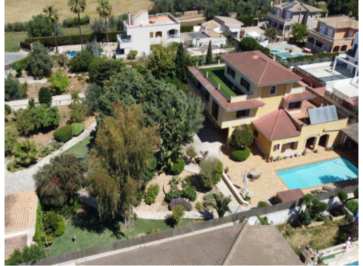
Townhouse villa with pool in Lluçmajor