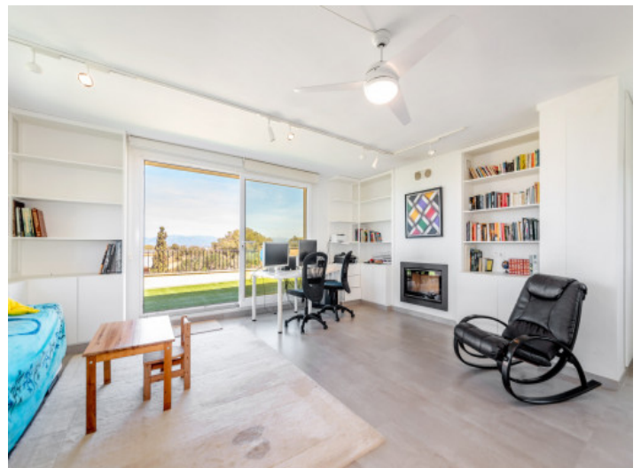
Bedroom with terrace

All information is correct to the best of our knowledge. Errors and prior sale excepted. This prospectus is purely for information purposes. Only the notarized deed of sale is legally binding.