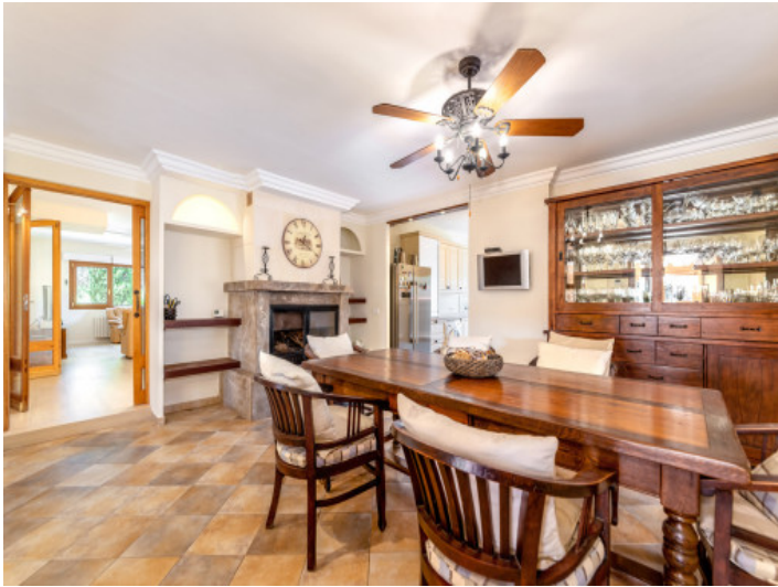
Rustic dining area