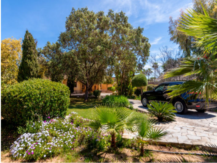
Garden and exterior area of the townhouse