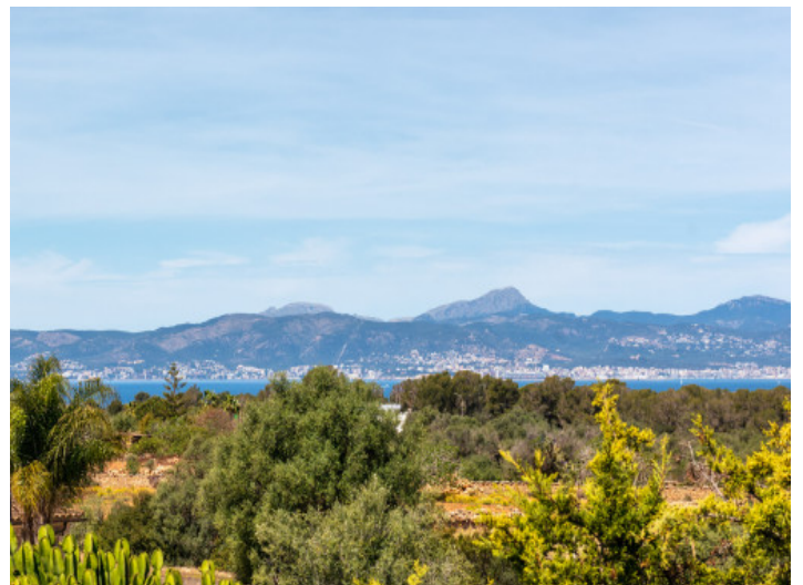
Splendid views to the sea

All information is correct to the best of our knowledge. Errors and prior sale excepted. This prospectus is purely for information purposes. Only the notarized deed of sale is legally binding.