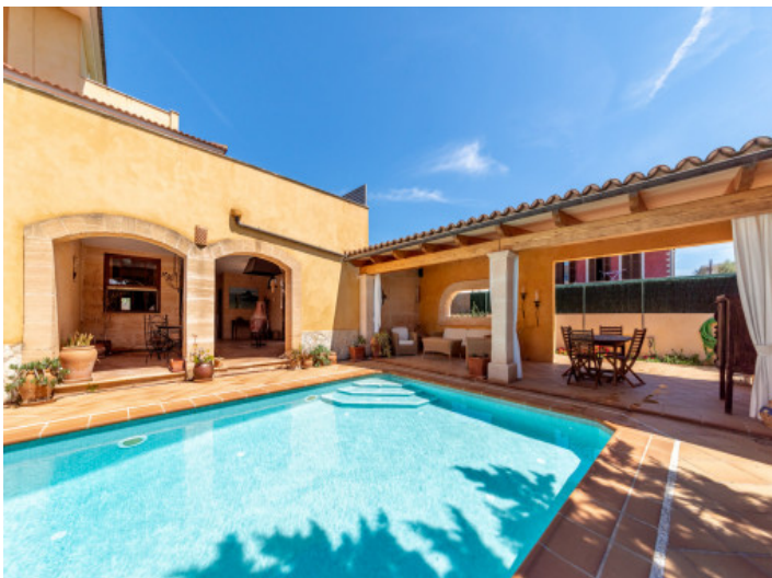
Pool area and covered terrace