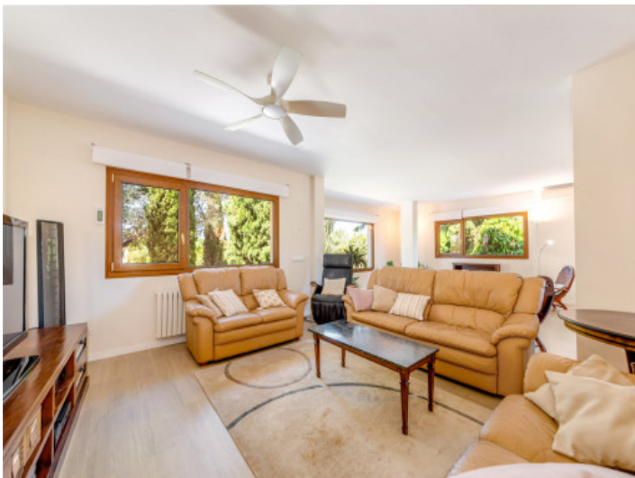
Open living area