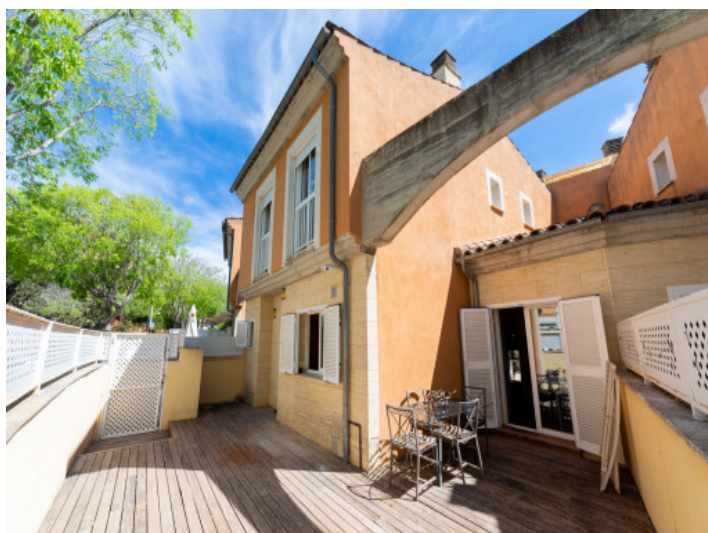
Sunny terrace with seating