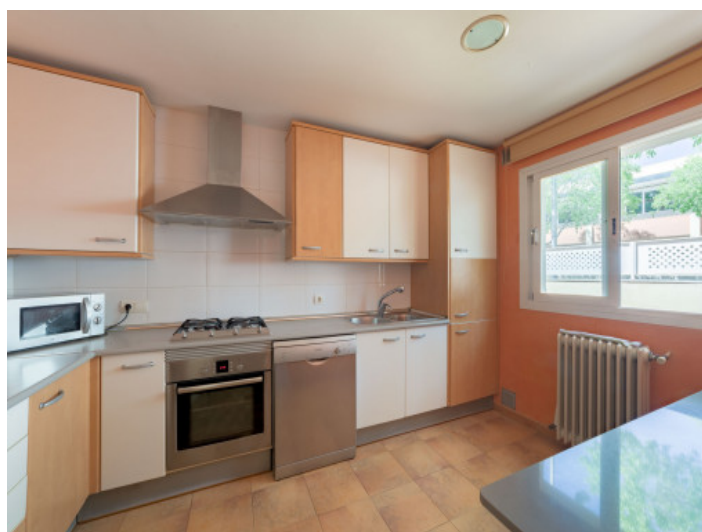
Bright, fully equipped kitchen

All information is correct to the best of our knowledge. Errors and prior sale excepted. This prospectus is purely for information purposes. Only the notarized deed of sale is legally binding.