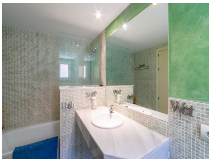
Bathroom with a bathtub