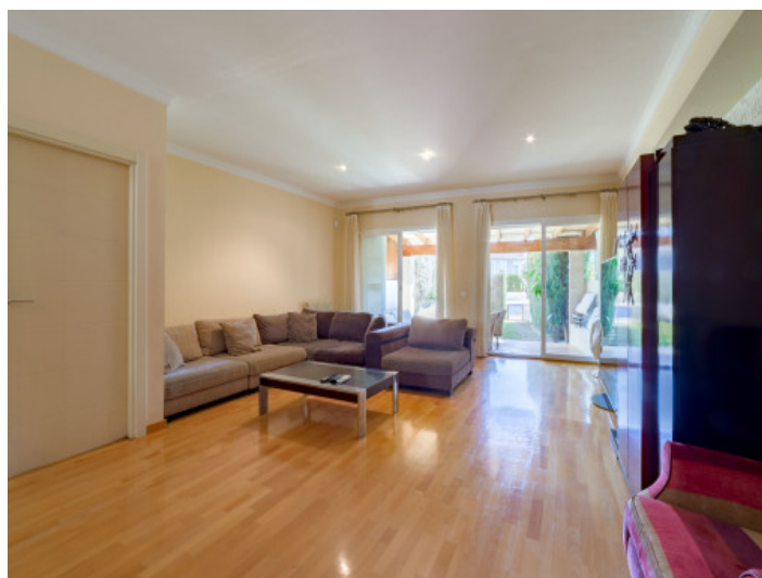
Living room with direct access to the terrace