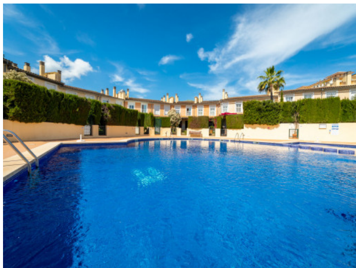
Large community pool