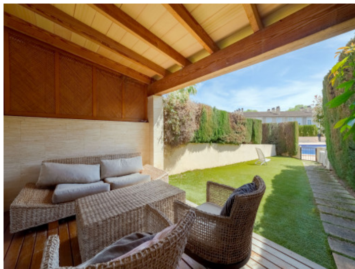
Covered terrace and the garden