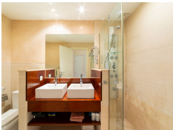
Bathroom with a shower