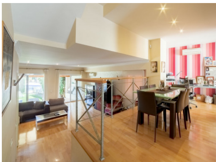
Beautiful dining area