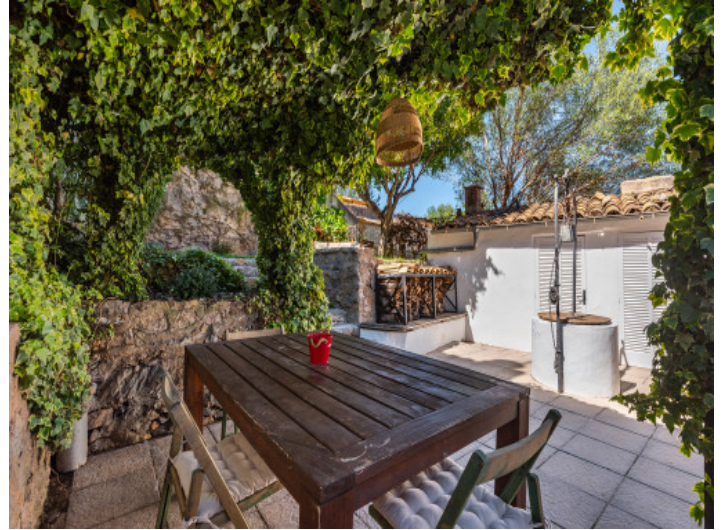
Outdoor dining area