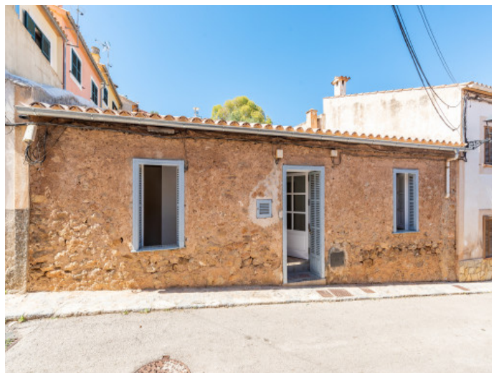
Natural stone façade