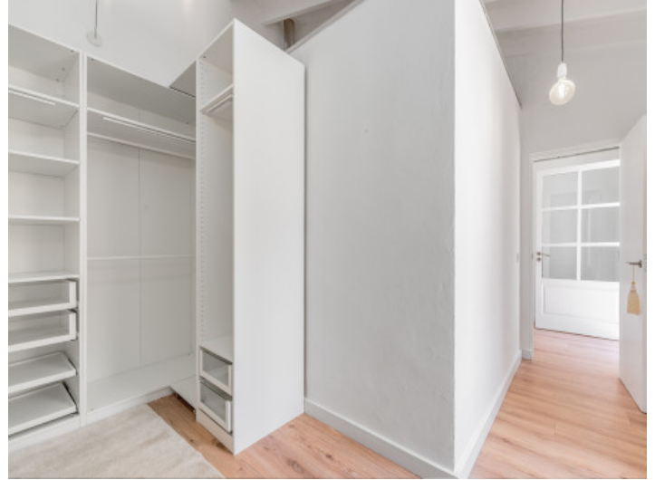
One of 2 bedrooms