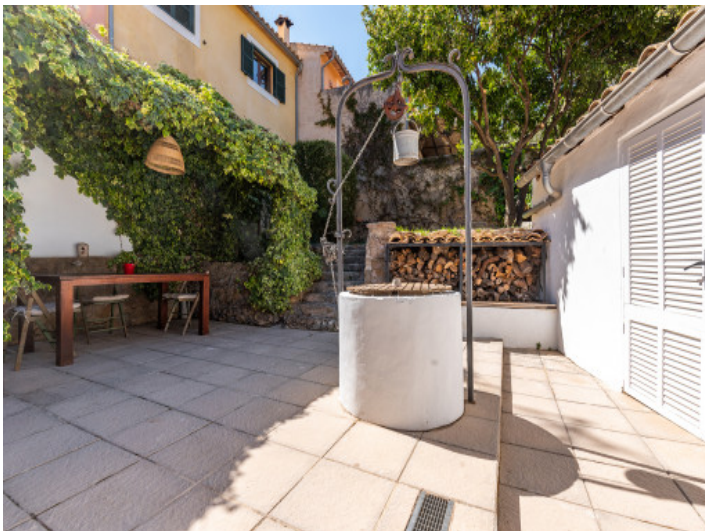
Sunny terrace with a well