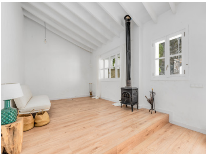
Living area with a stove