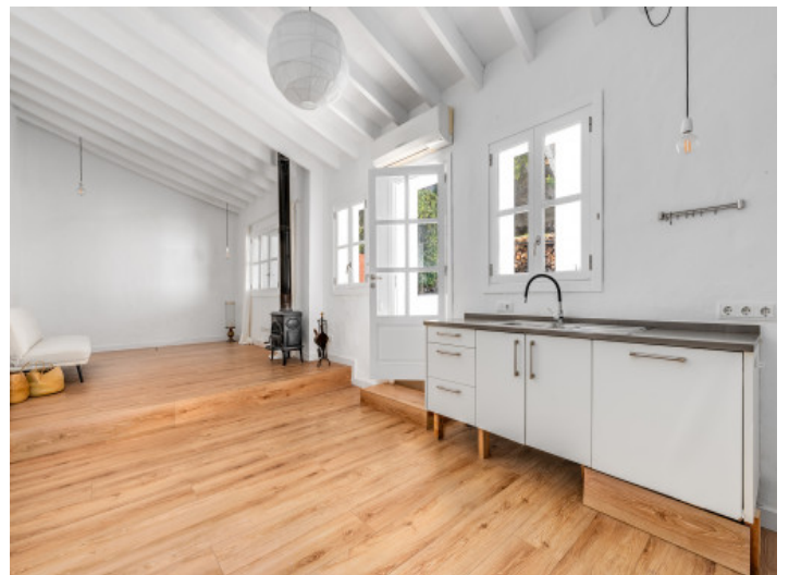
Open, modern kitchen

All information is correct to the best of our knowledge. Errors and prior sale excepted. This prospectus is purely for information purposes. Only the notarized deed of sale is legally binding.