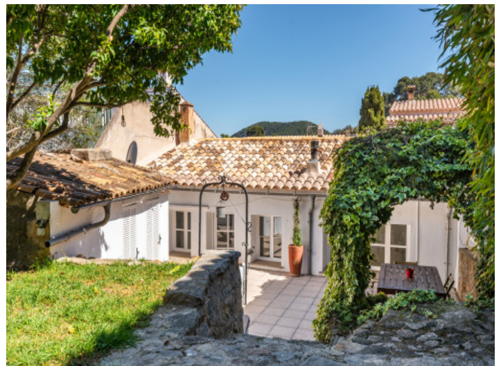
Enchanting outdoor area

All information is correct to the best of our knowledge. Errors and prior sale excepted. This prospectus is purely for information purposes. Only the notarized deed of sale is legally binding.