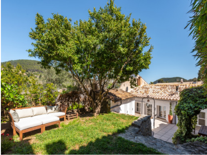
Garden with seating