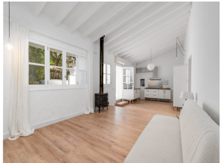
Spacious living area