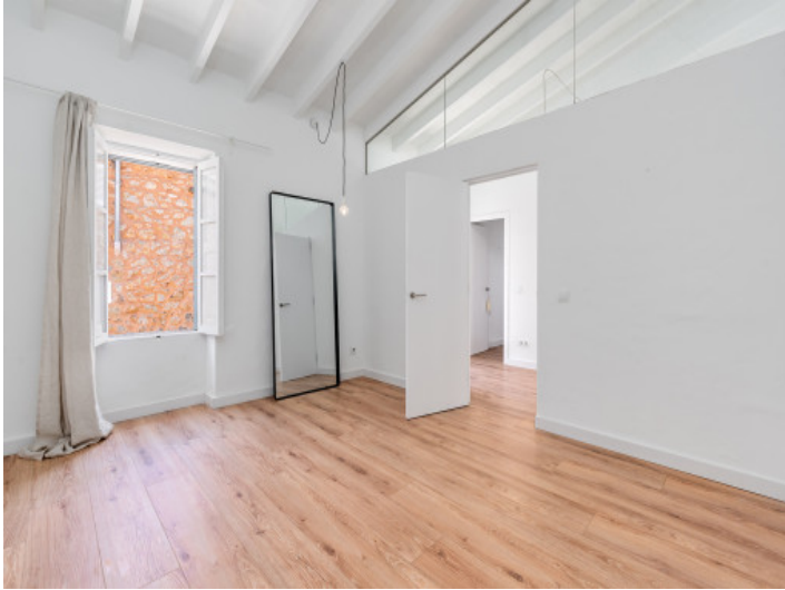
One of 2 bedrooms